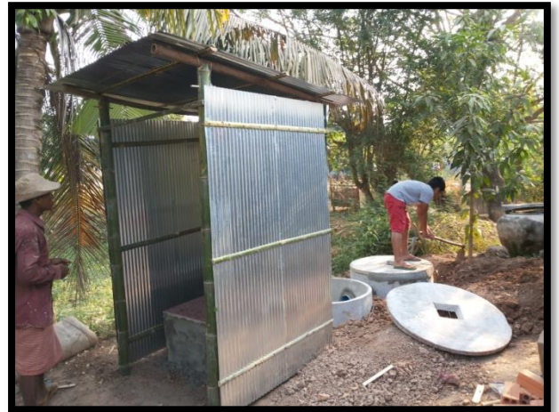
The construction activity and Photos at site and family.