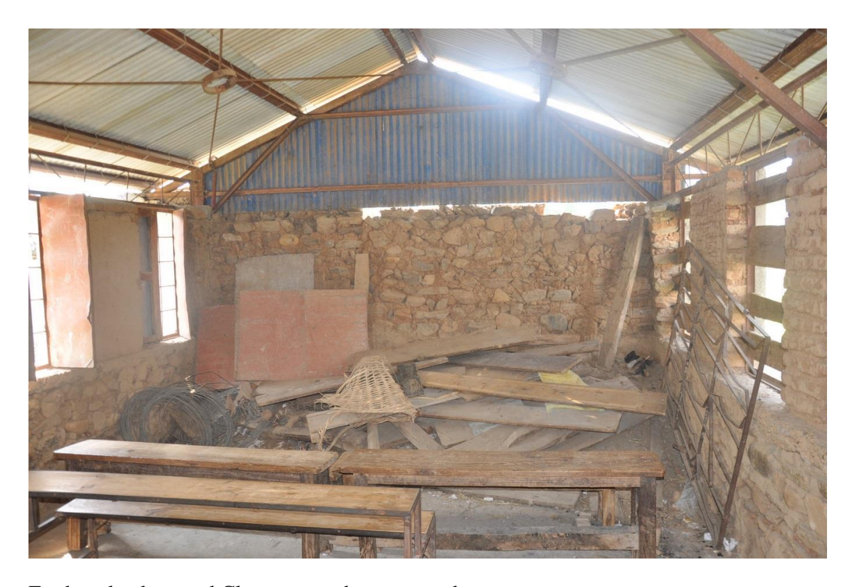
Appendix B. Project Photos

Earthquake damaged Classroom to be renovated.