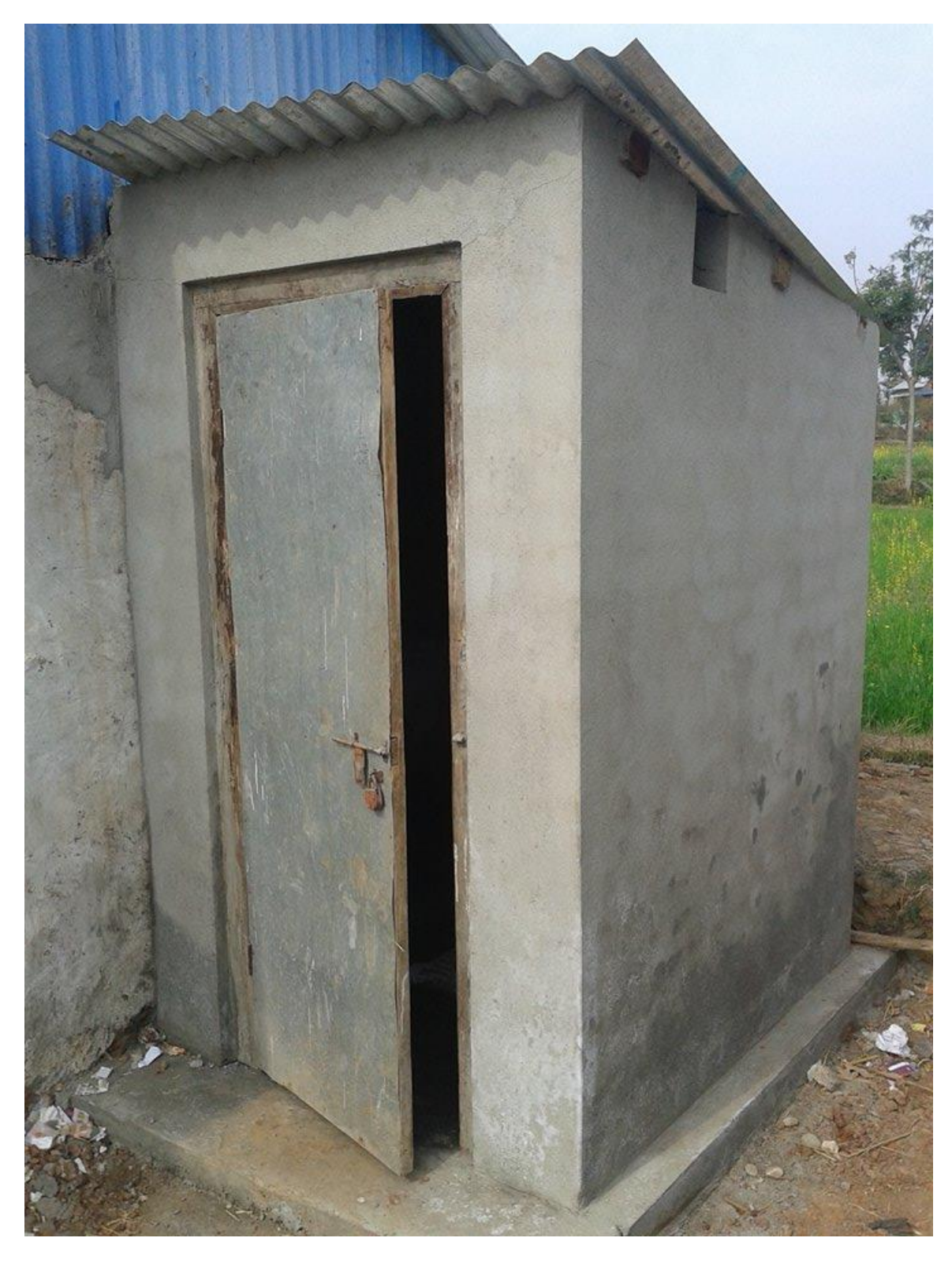
This newly constructed toilet was built to replace a toilet destroyed at the school in Deuralitar Village.