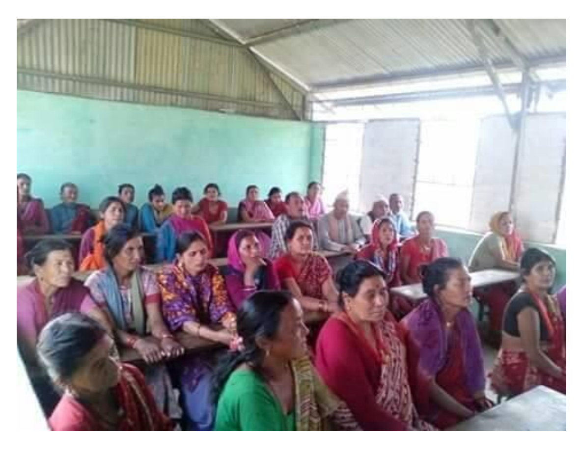
Parent orientation in new classroom.