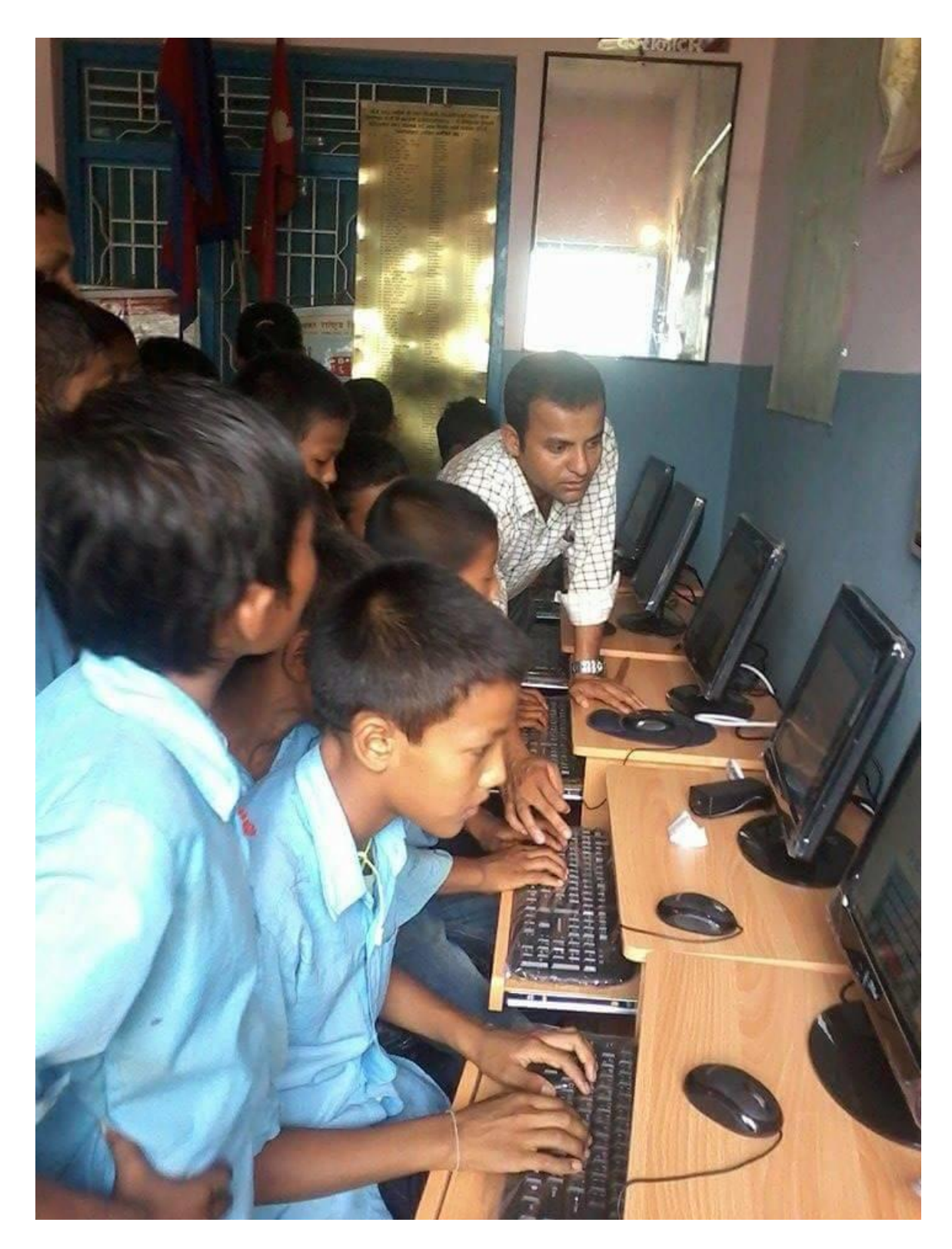
Students and instructor in new computer lab.