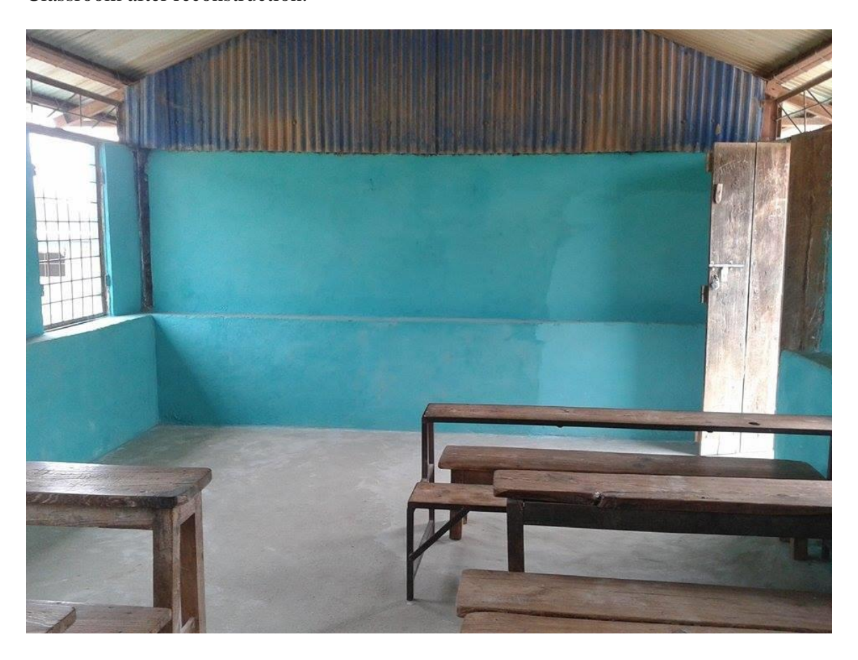
Classroom interior after reconstruction with new furniture.