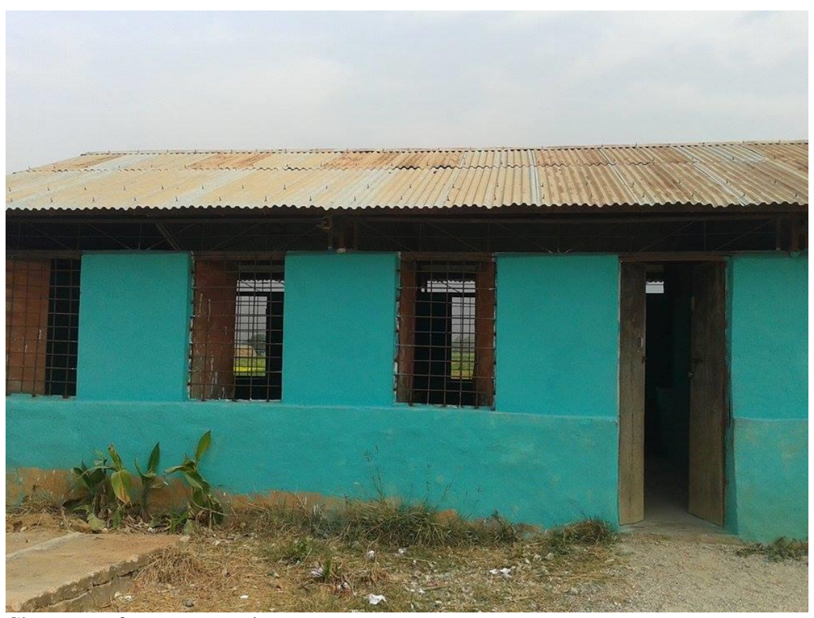
Classroom after reconstruction.