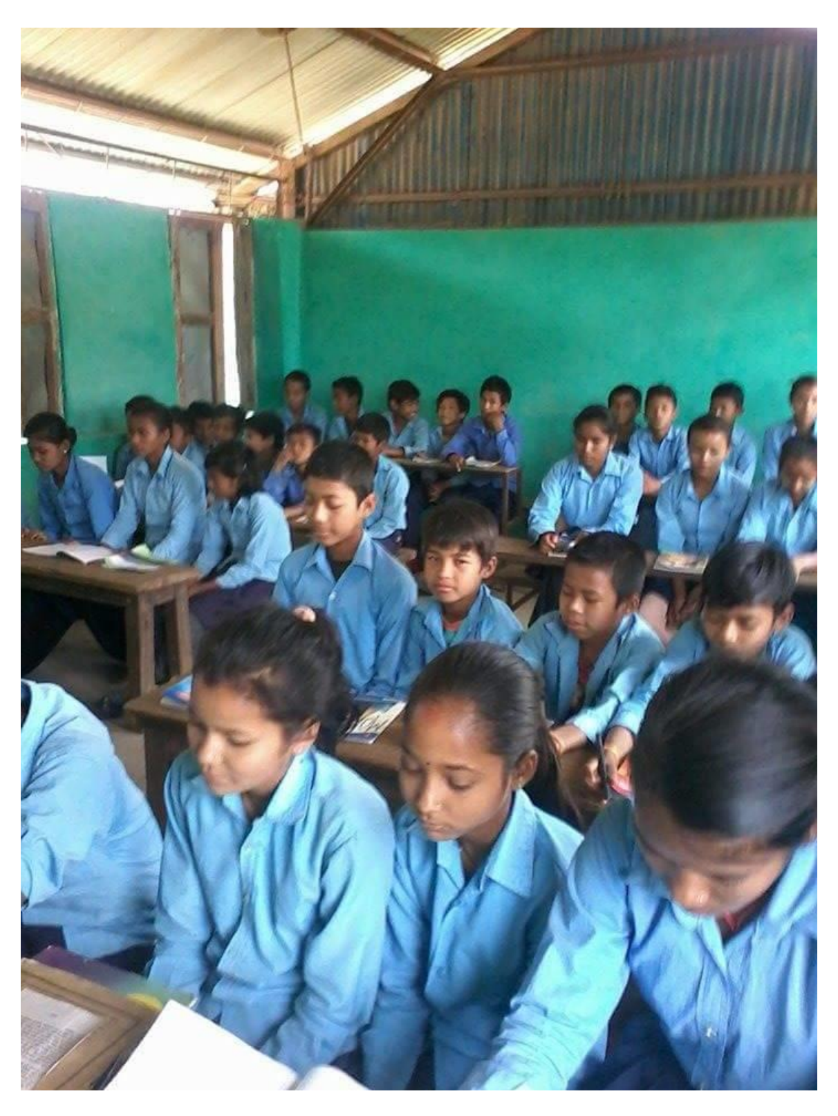
Students in class in newly constructed school room.