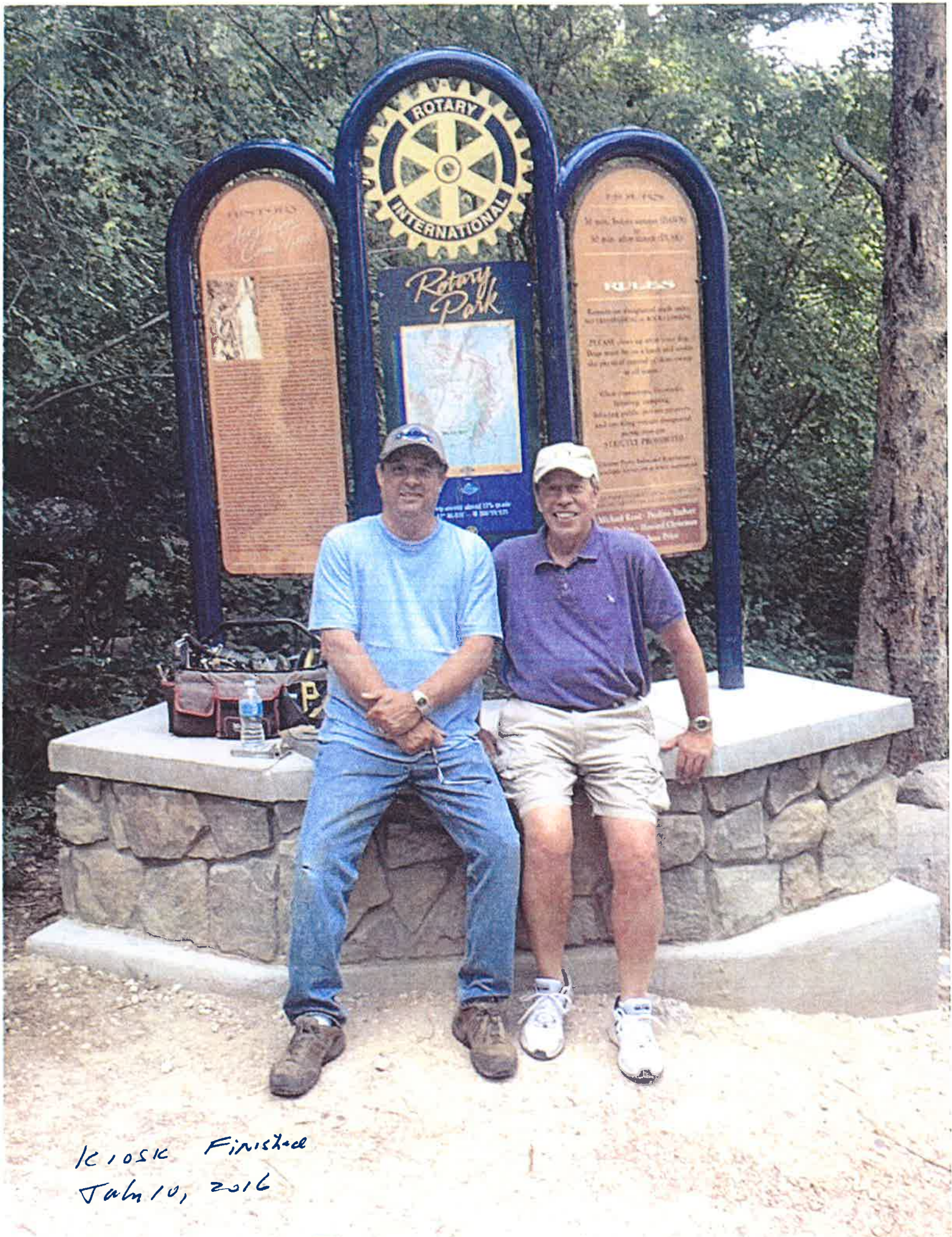
1010516 Finished July 10, 2016