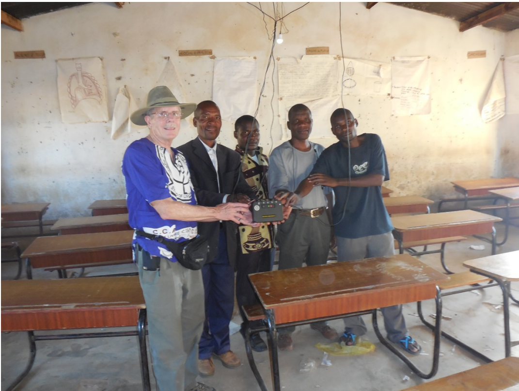
Another Rotary-sponsored solar light kit is given to Luwerezi Primary School teachers