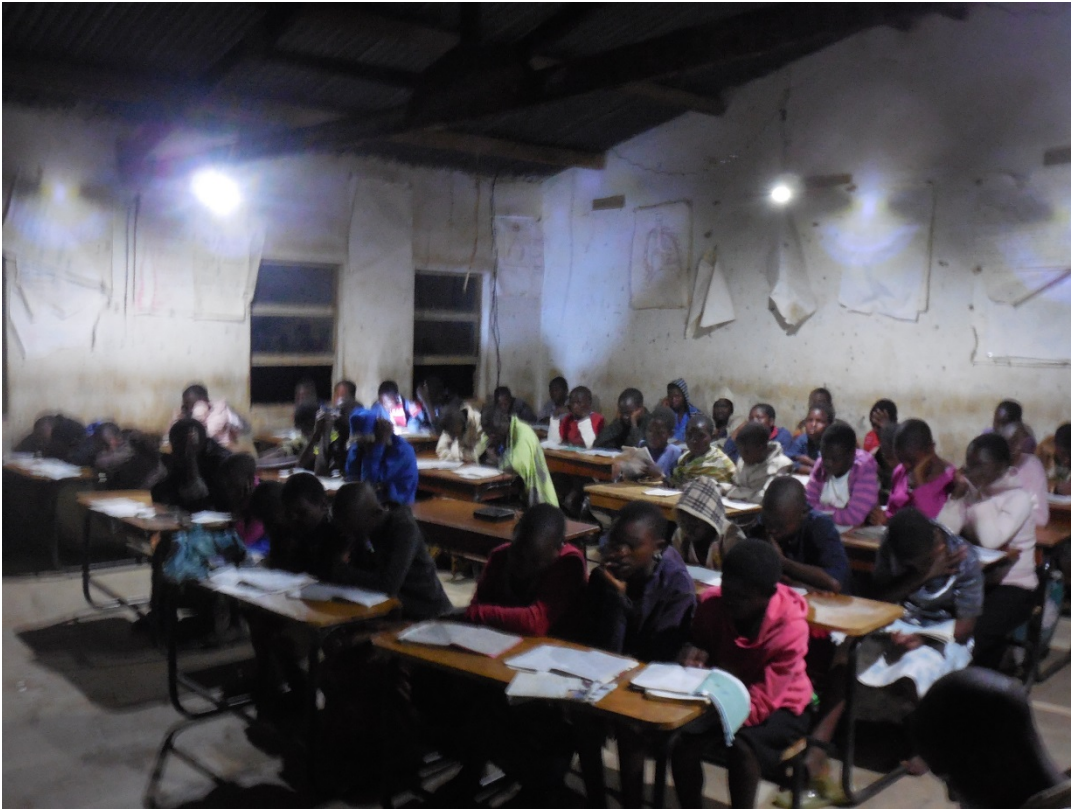
Standard 7 students at Luwerezi Primary School study from 6:00PM to 8:00PM every weekday night to improve exam grades.