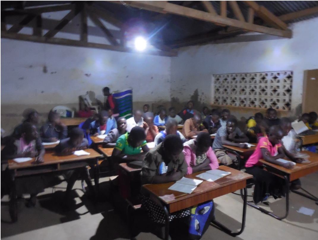
Engalaweni FP School Standard 7 students study with light from a Rotary-sponsored Solar Light kit.