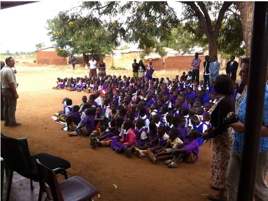
Student Assembly May 28, 2015 at Big Johns Primary School