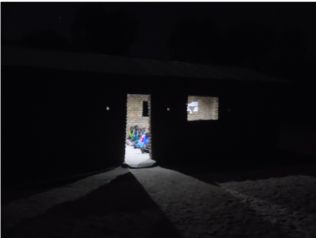
Mfula school classroom is now well lit by Rotary-sponsored solar light kit.