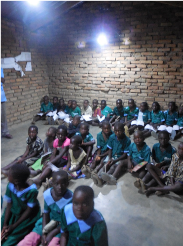
Standard 6 students at Mfula JP School hold classes after dark.