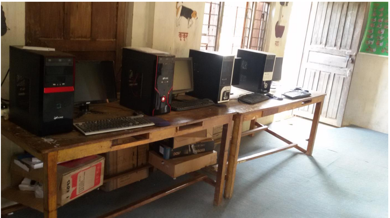
Four New Computers for Training Deaf Students