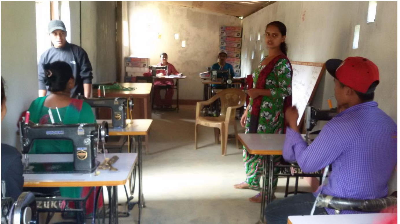
Another view of Deaf Students in Sewing Center