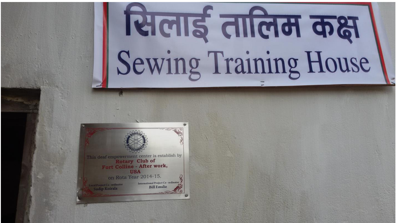
Sewing Center Sign on Deaf Empowerment Center