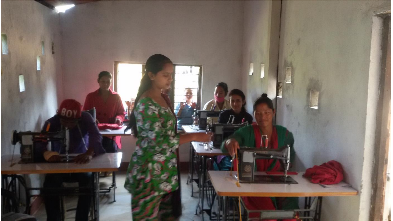
Deaf Students in New Sewing Center