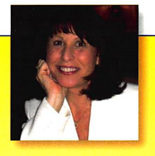
Thank You to our Superhero Board of Directors for your support and leadership!