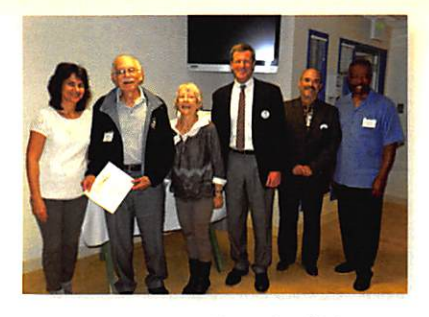
"Thank You" to the Porsche Club of America, Grand Prix Region for choosing the CDHC as your fundraising beneficiary!