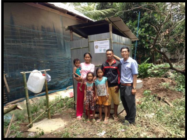
The handed over at the site with the photos