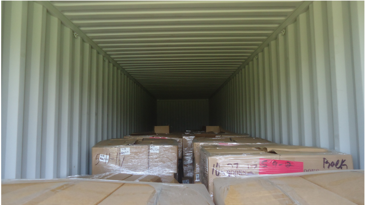
Pallets of textbooks from Books For Africa delivered to the Dawro Development Association for temporary storage for the Dawro Education Department.