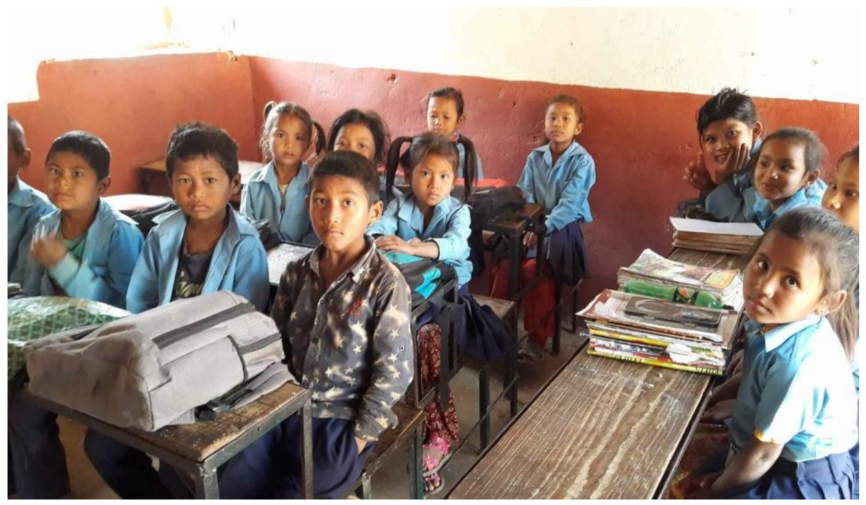
Classroom back in session.