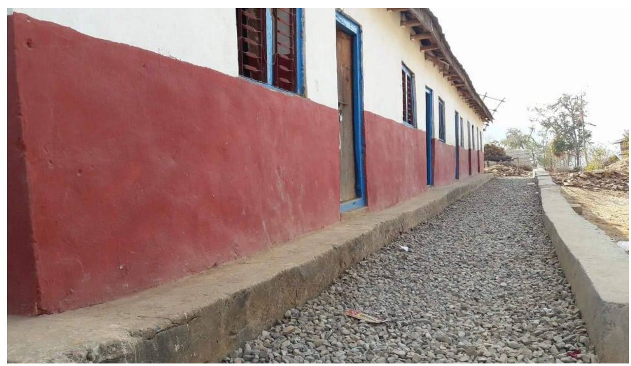
School Building. Five rooms were reconstructed