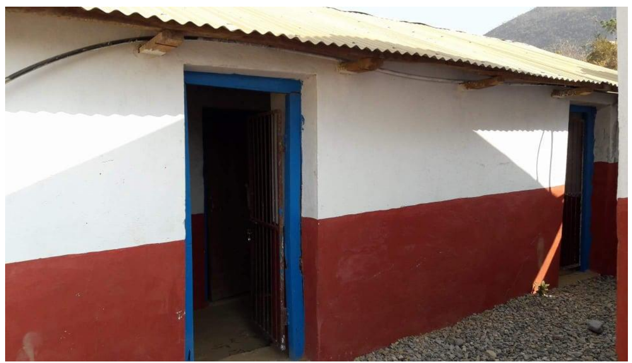
Reconstructed Male and Female Toilet