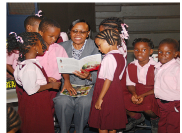
Virgin Islands Reading Council