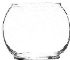
Round Glass Floral Bowls