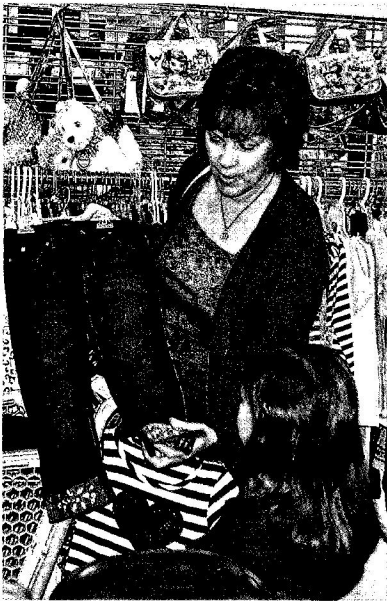
HOLIDAY SPIRIT -- A volunteer helps a child during the Rotary Club of La Mirada's Holiday Shopping Spree.