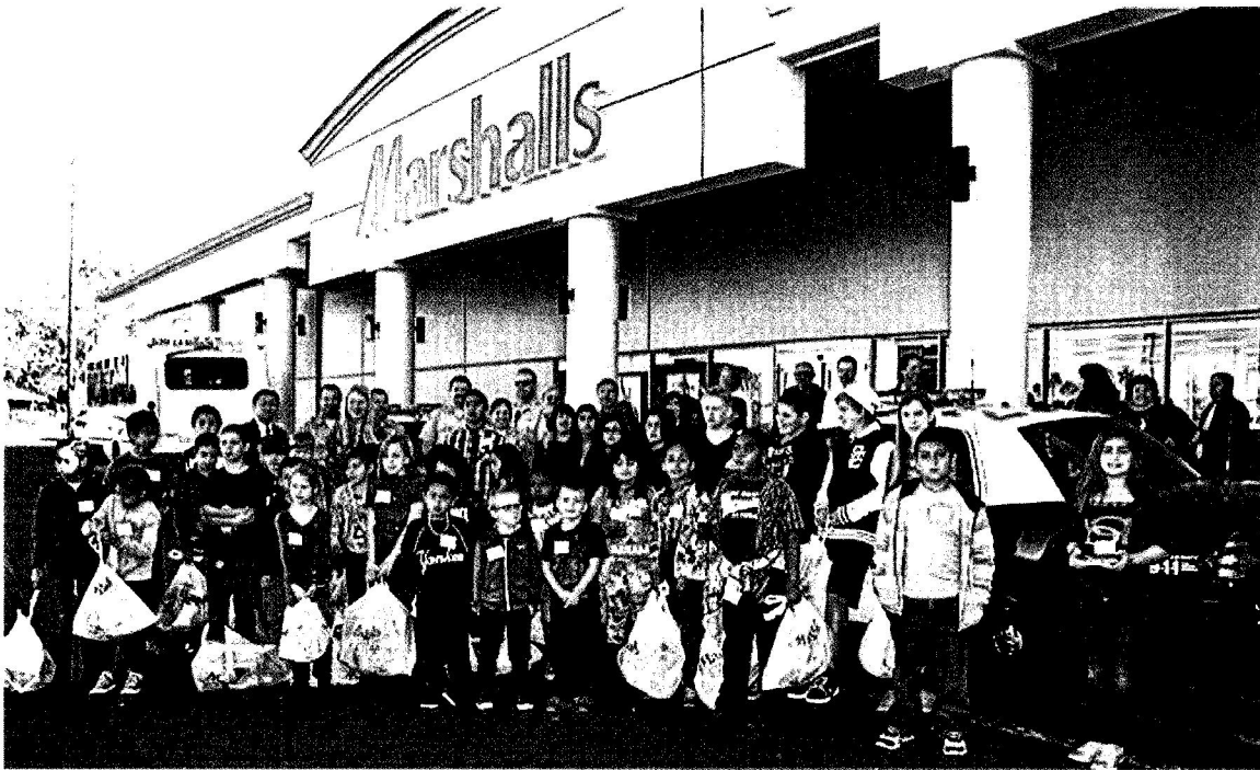
ROTARY HOLIDAY SHOPPING SPREE -- The Rotary Club of La Mirada hosted a Holiday Shopping Spree at Marshalls for 40 local children this week. Rotarians and other community volunteers purchased clothing, shoes and other items from lists provided by parents. A holiday party was held following the event with seniors living at The Palms Retirement Community.