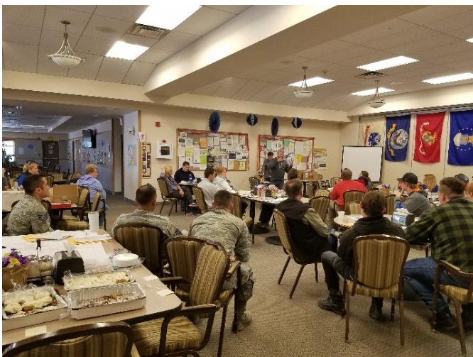
Training session prior to each installation