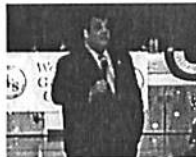
New Jersey Governor: I'm A Cowboys Fan ThePostGame