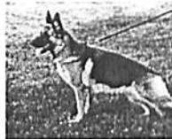
Twelve Great Dog Breeds to Protect You PuppyToob