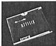
15 Services That Allow You To Cut Your Cable Cord TV Destination