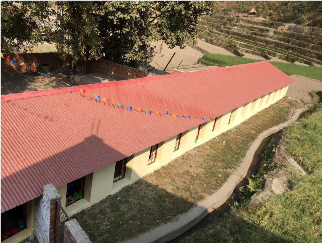
Overview of new roof.