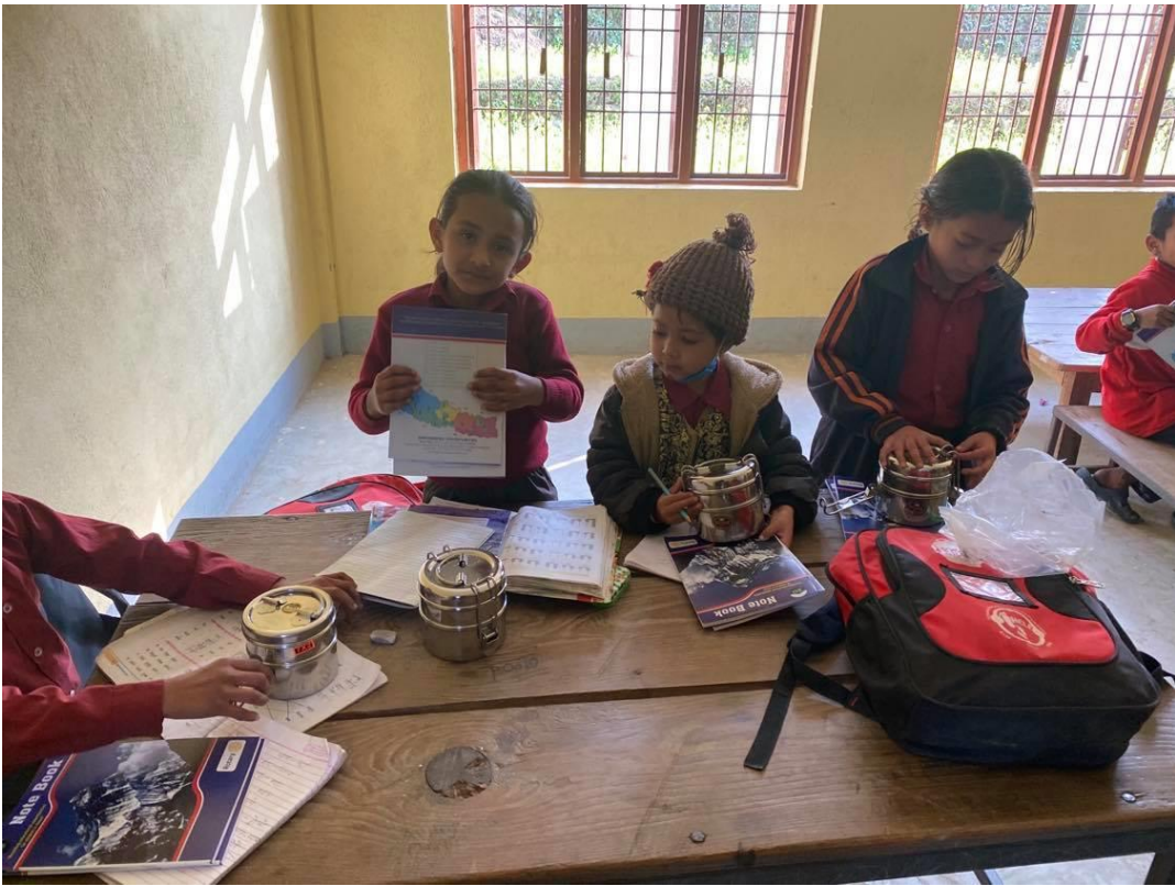
Children receiving notebooks.