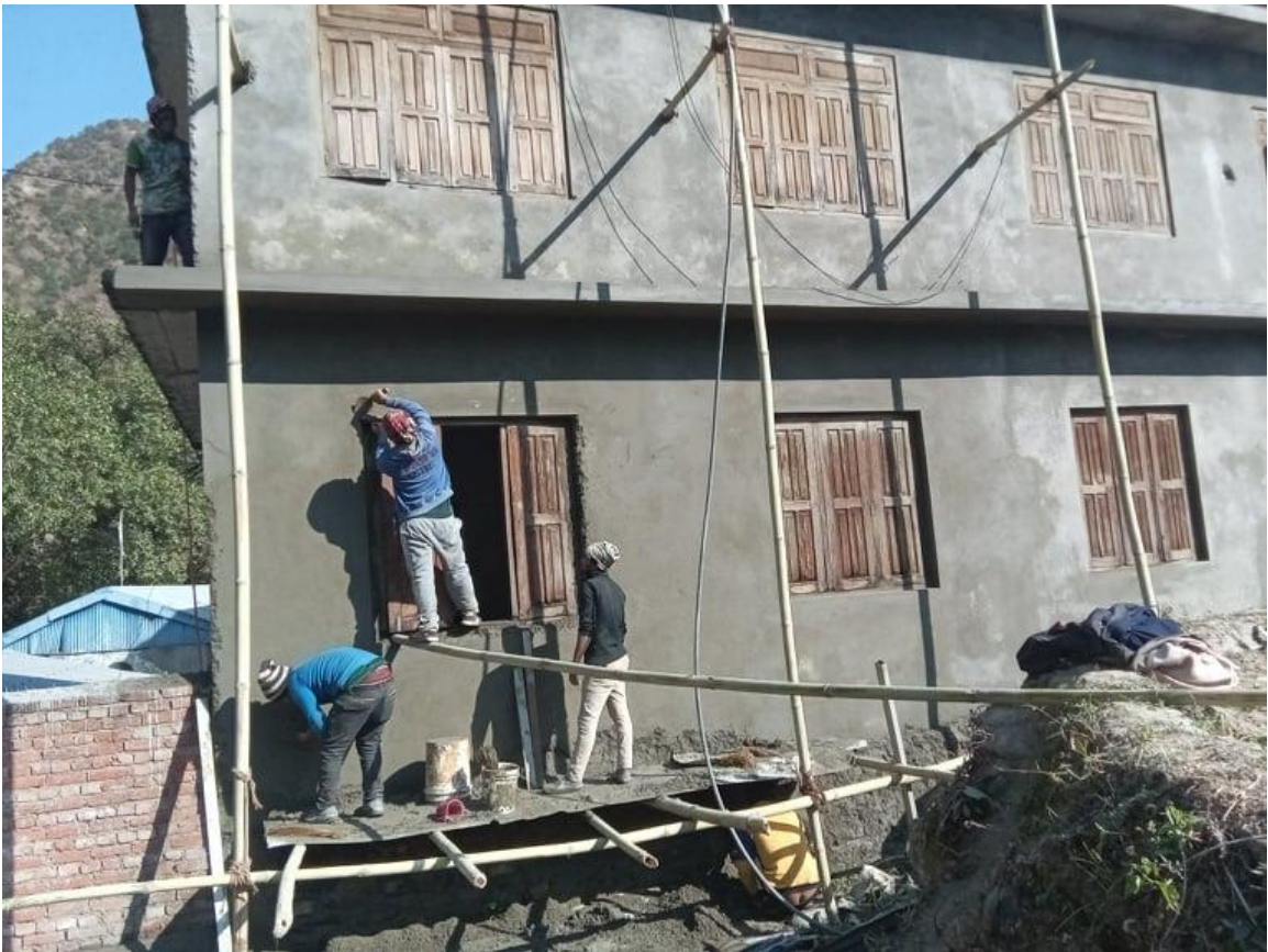
Applying new stucco.