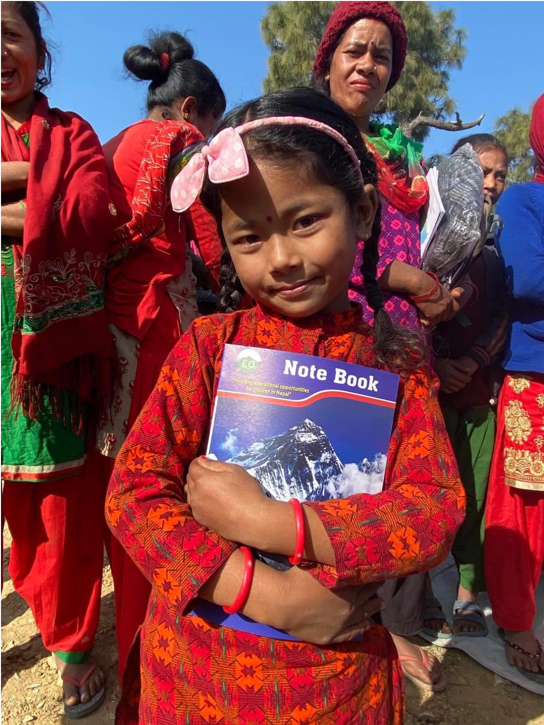
Child with new notebook supplied through Empowering Opportunities.