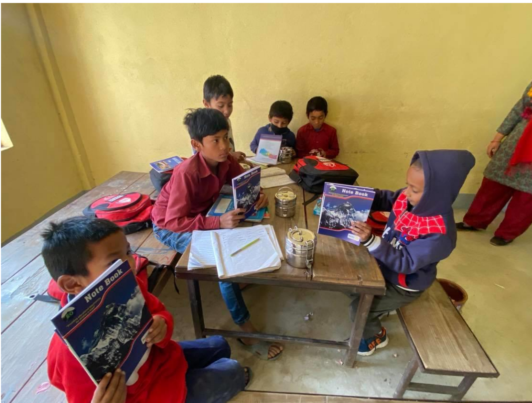
Children receiving notebooks.