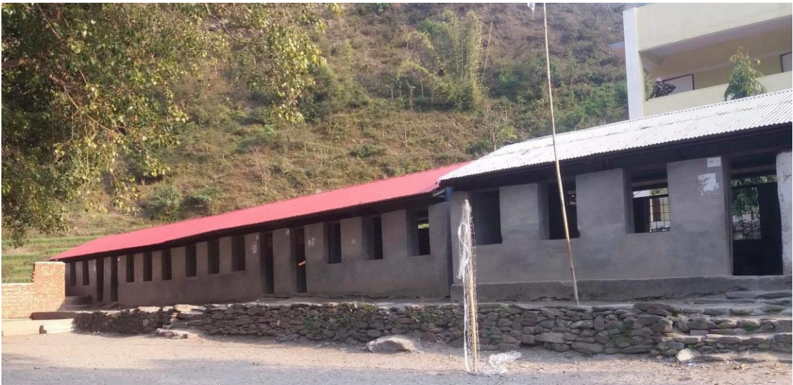
Detail of new roof.