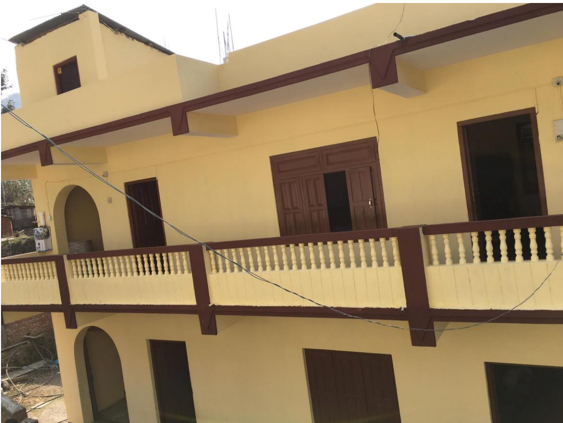
Upper level of completed school reconstruction.