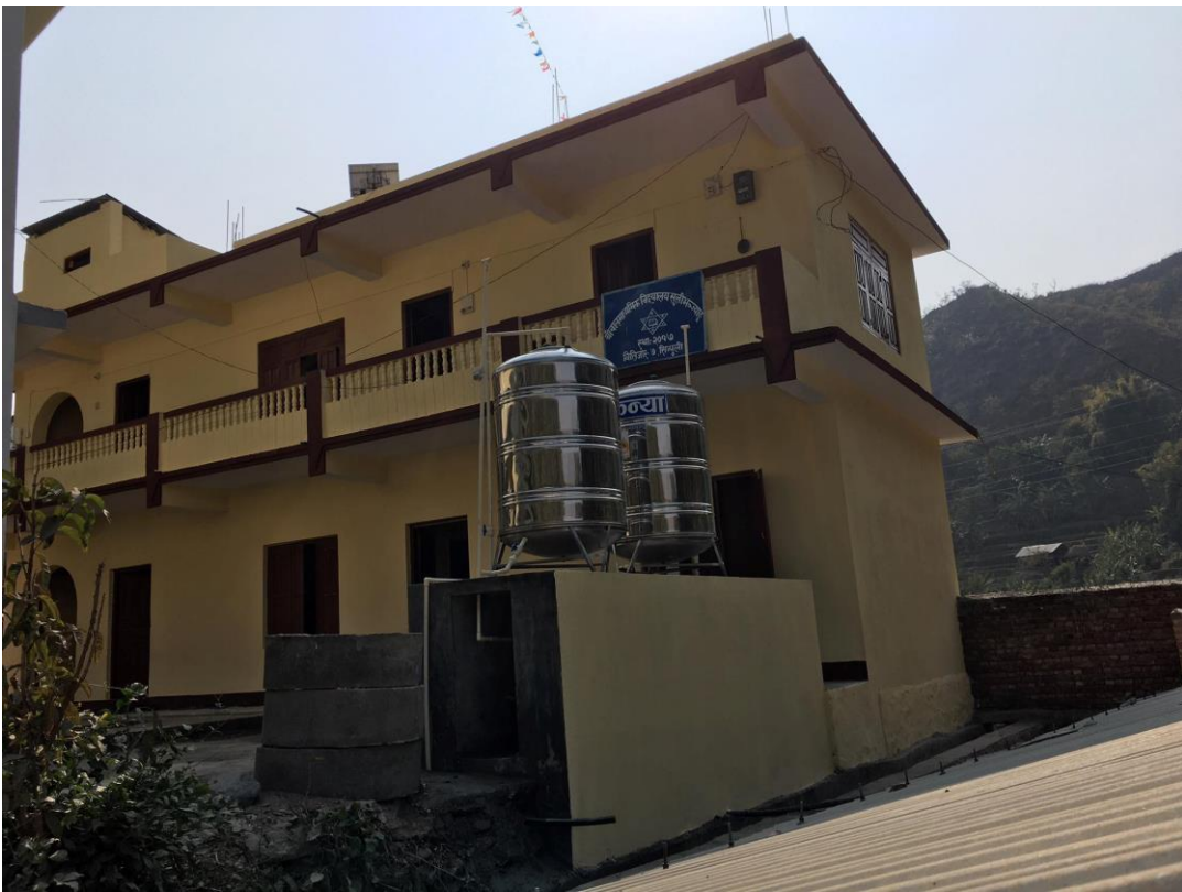
View of upgraded water supply.