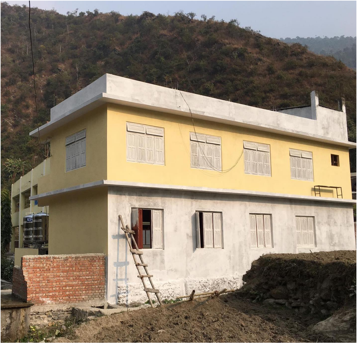
Shree Bal Secondary School during reconstruction.