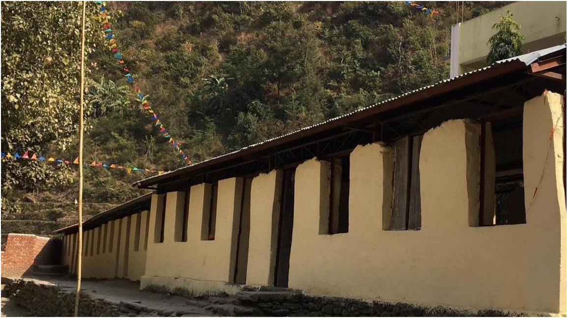
Shree Bal Primary School