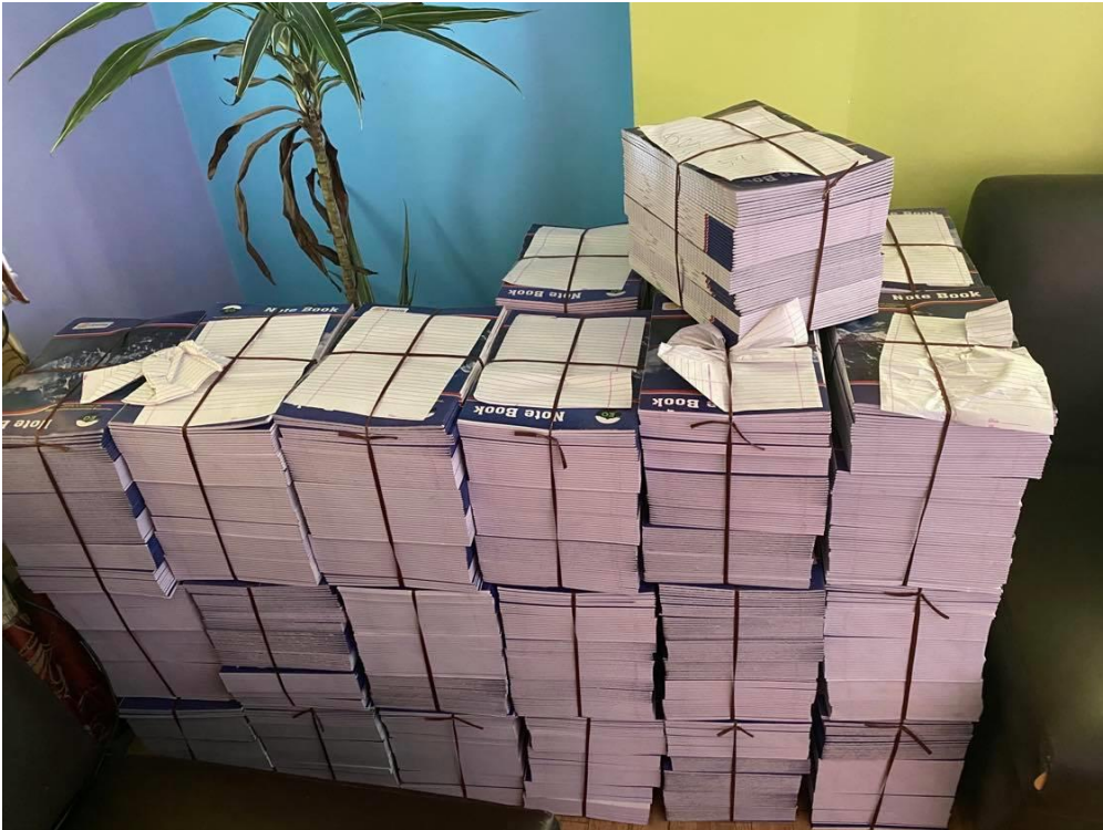
More student notebooks.