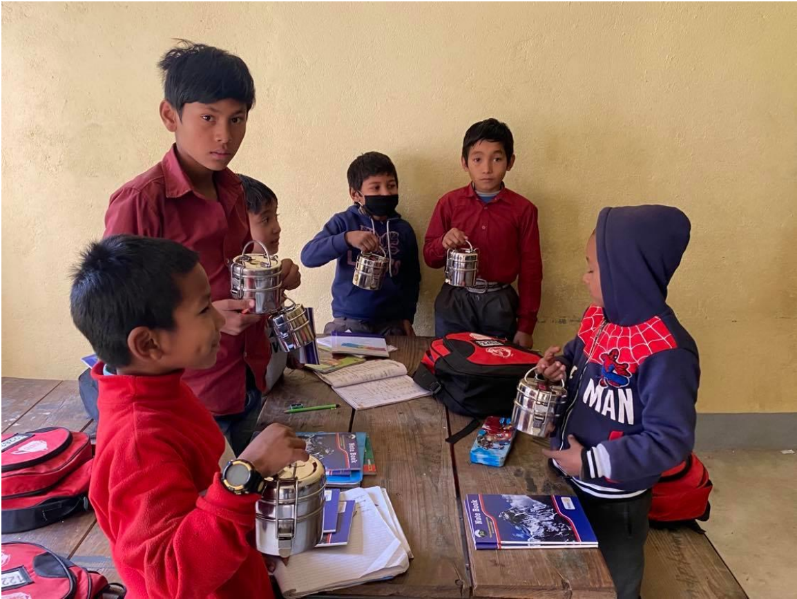
More children receiving notebooks.