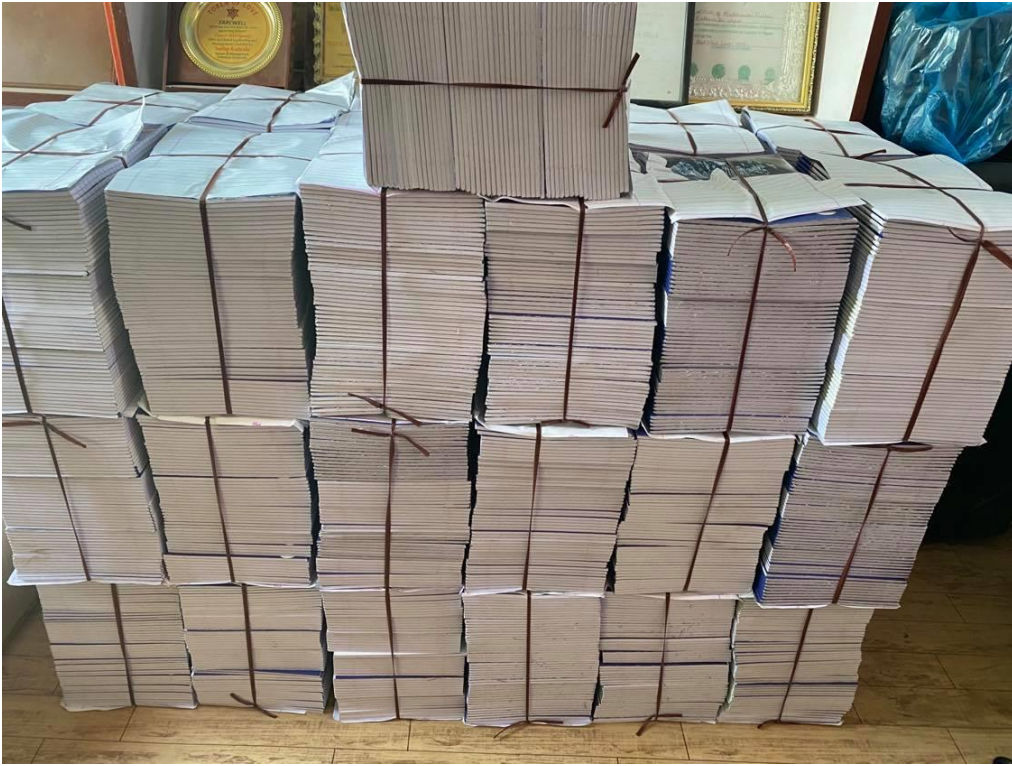
Full year supply of new student notebooks.