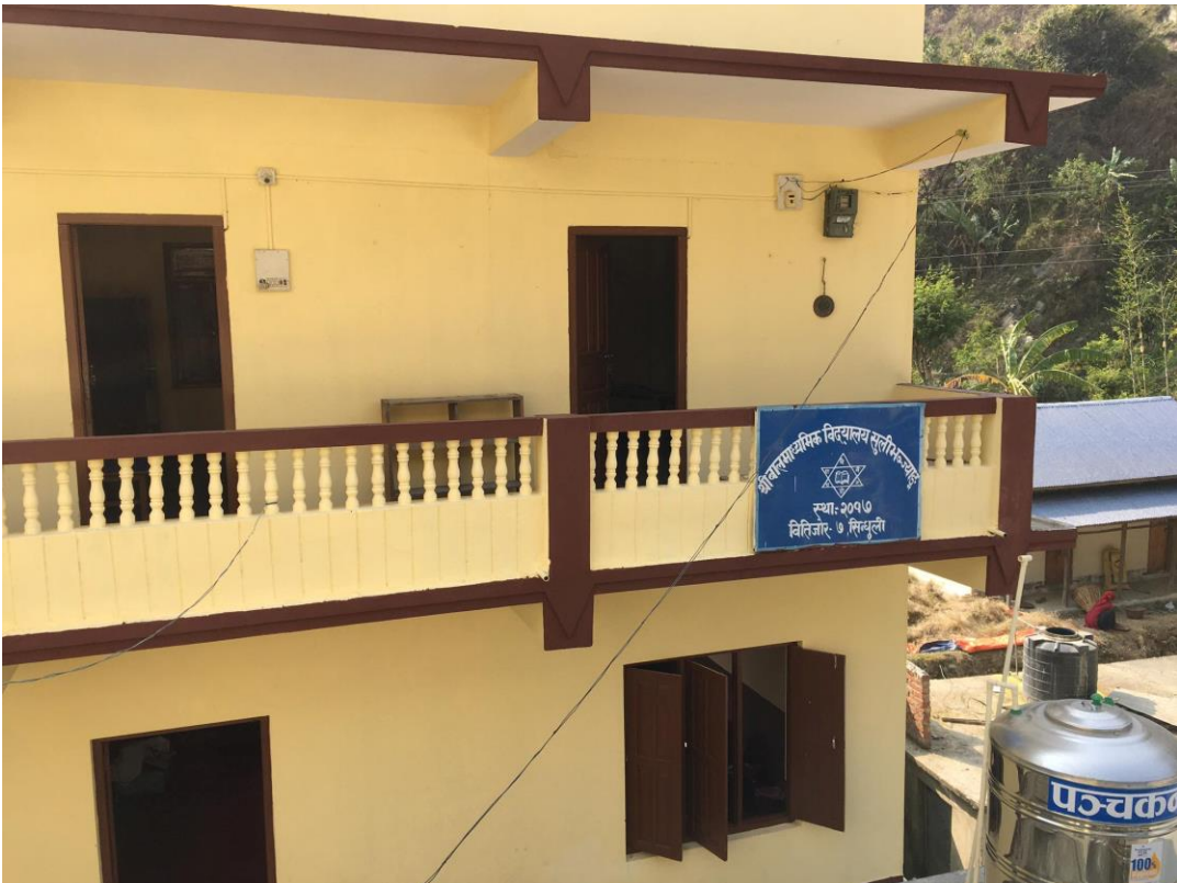
Completed Shree Bal Primary School.