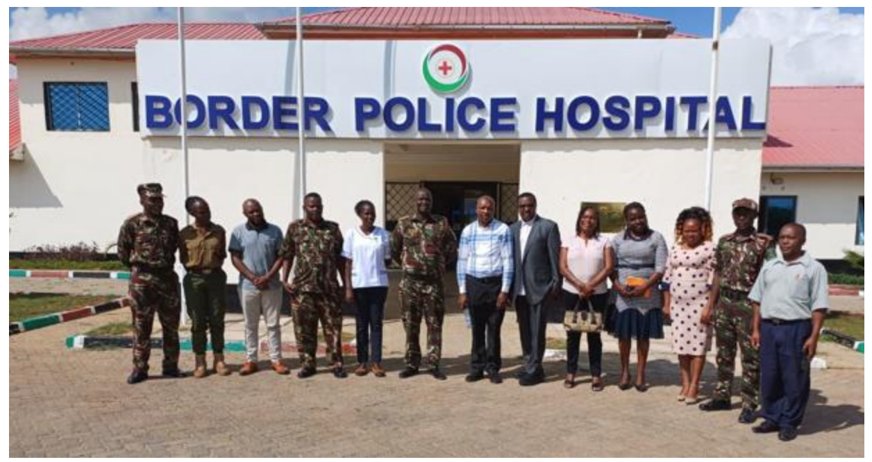
Event planning. Nearby hospital that could treat community members if an emergency need arises.