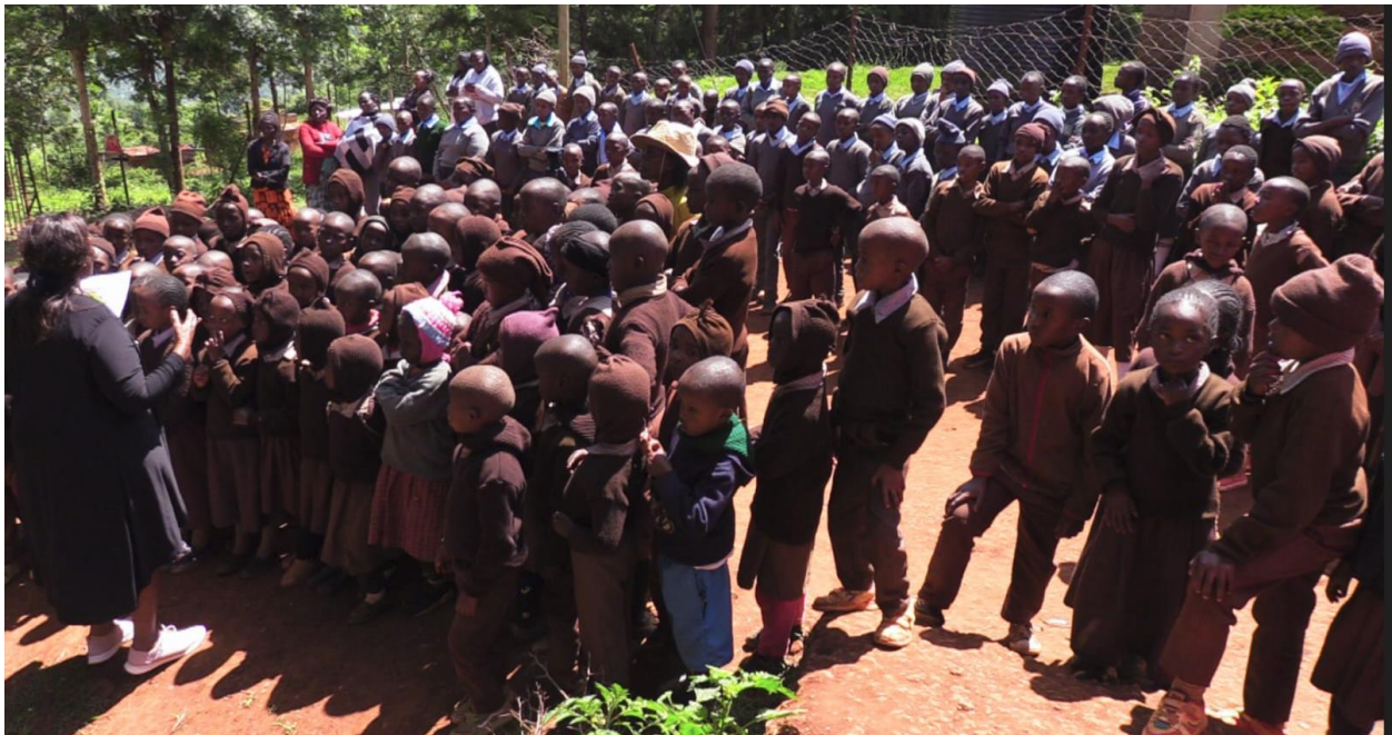
HEALTH EDUCATION TALK.