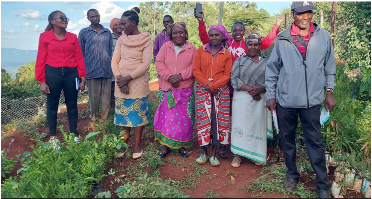
Rotarian meeting with trainees at the seedling nursery.