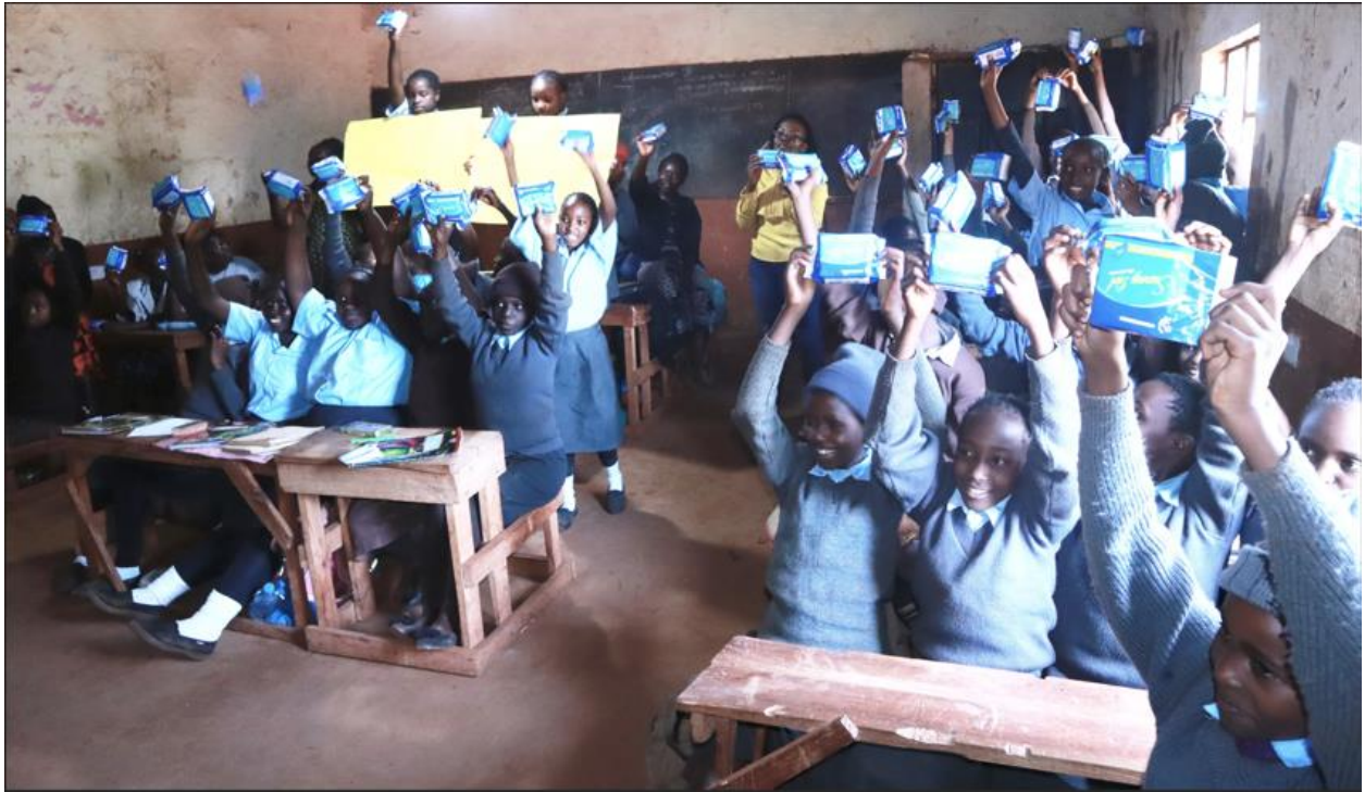
SANITARY PADS SUPPLY TO SCHOOL AND STUDENTS.