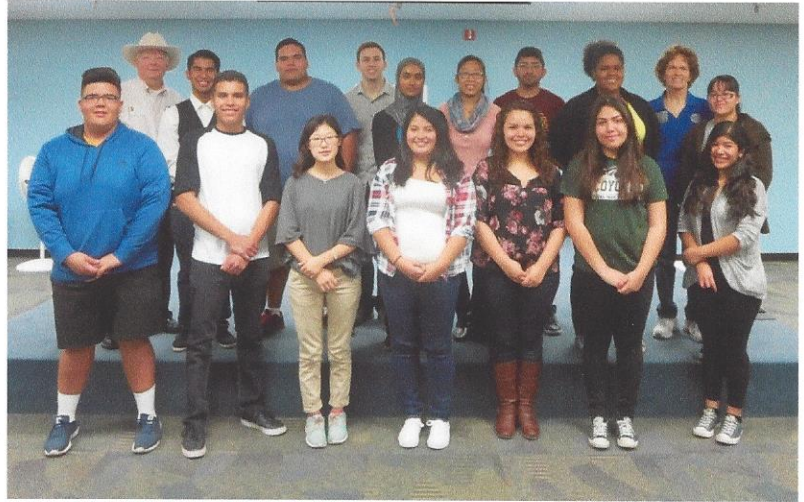
High School students (front row) were mentored by Rotaractors and Rotarians

SATURDAY, JANUARY 24 TH 1:30 PM BUENA PARK LIBRARY AUDITORIUM