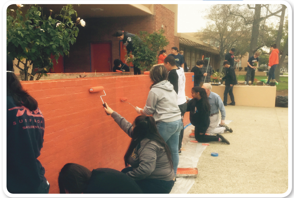
OHS students and Rotarians brighten up a wall and introduce new vegetation in a rehabilitated planter.