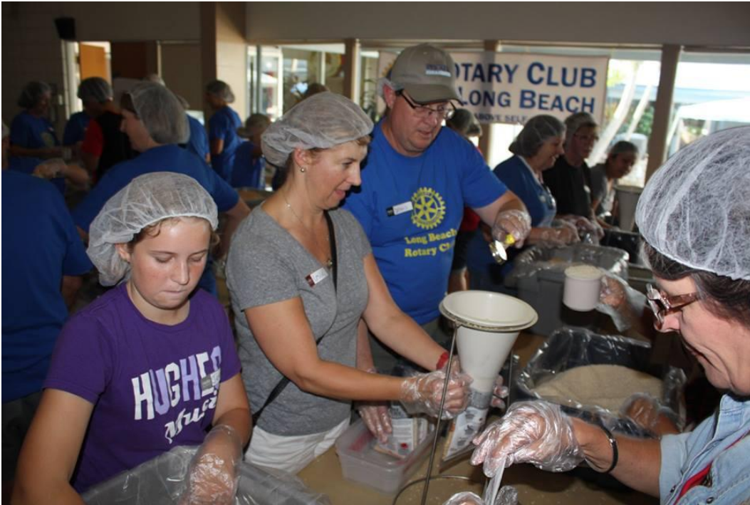
Three generations work side-by-side on the packaging assembly line

And some pictures from the Stop Hunger Now packaging event: