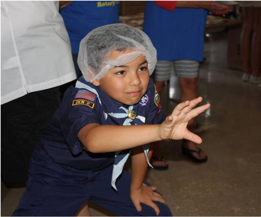
The Cub Scouts Invented a New Way to Transport the Sealed Packages--Throw Them!