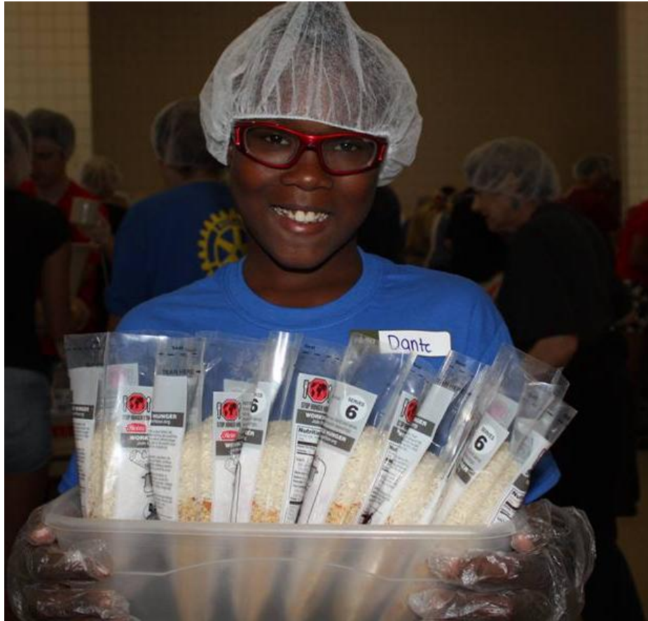
Filled Packets are Carried to the Sealing Station