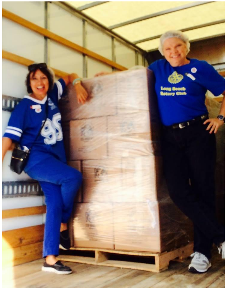
Some of the 35,970 Finished Meals, Packaged and on the Truck