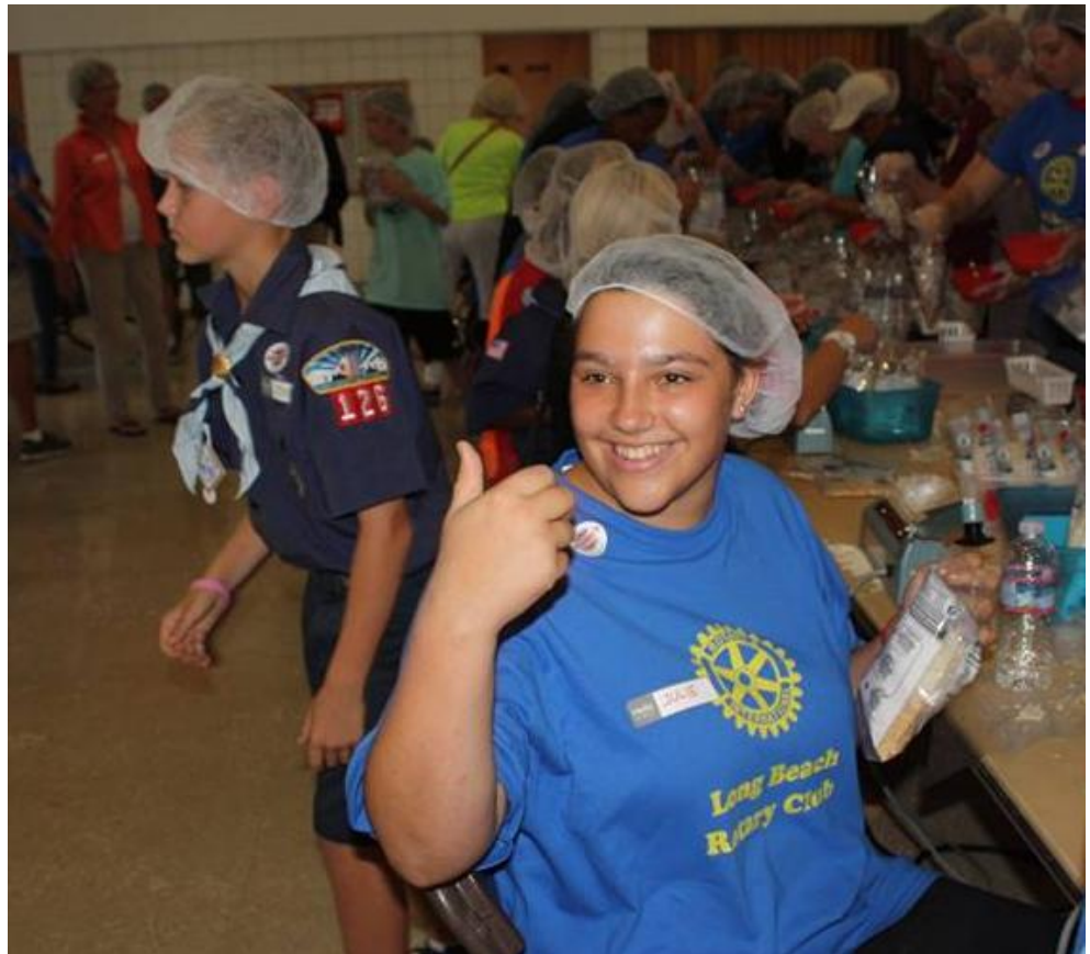
Scouts and Rotarian Family Members Enjoyed Packaging Up Meals