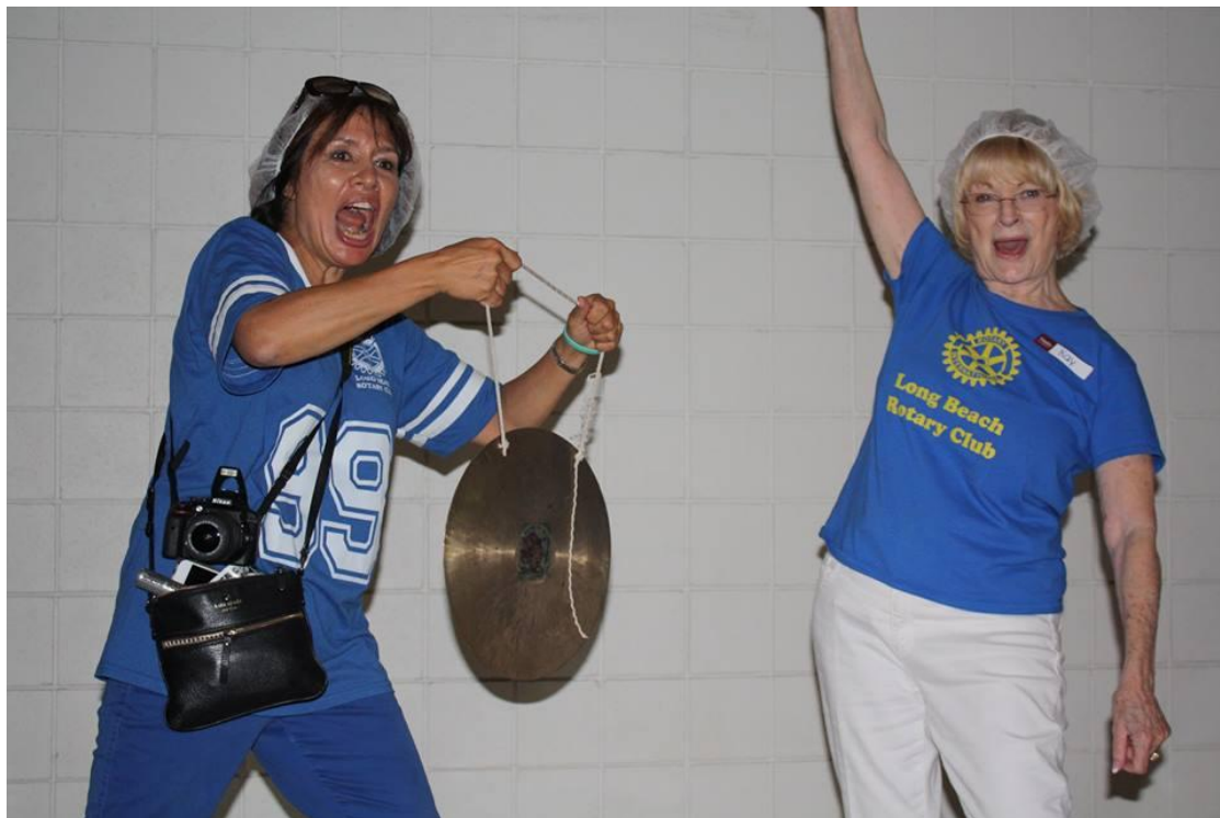
Every 1000th Meal Merited a Gong Ring. We Bang the Gong 35 Times!