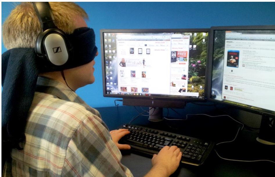
JAWS (Job Access With Speech) For Windows