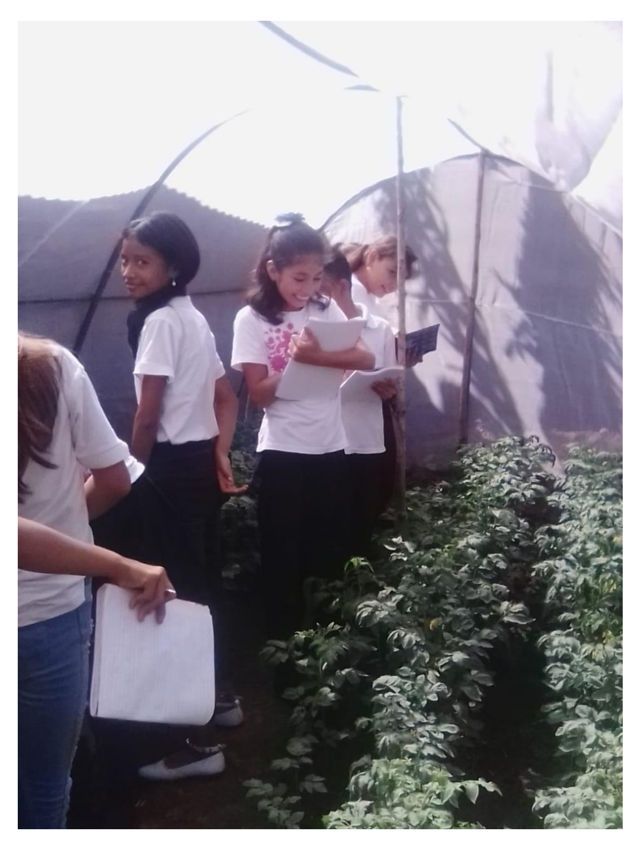
Students receiving class instruction inside a insect protection tunnel.