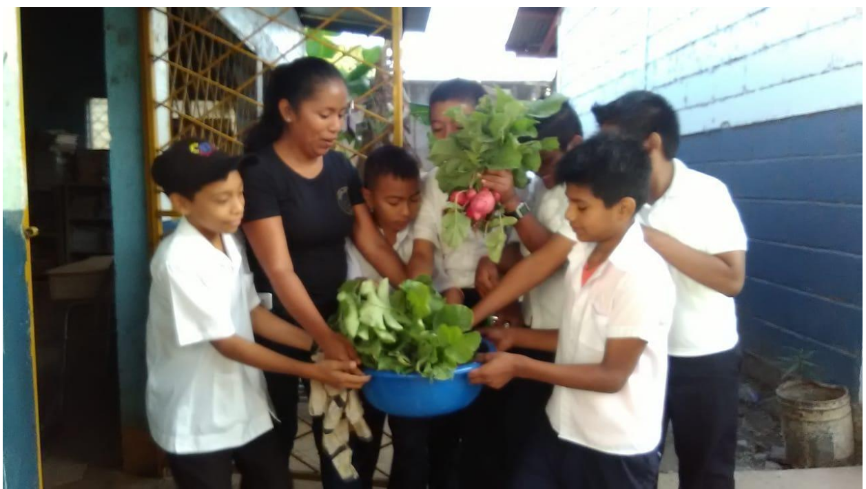
Veggies for lunch coming from the school garden.