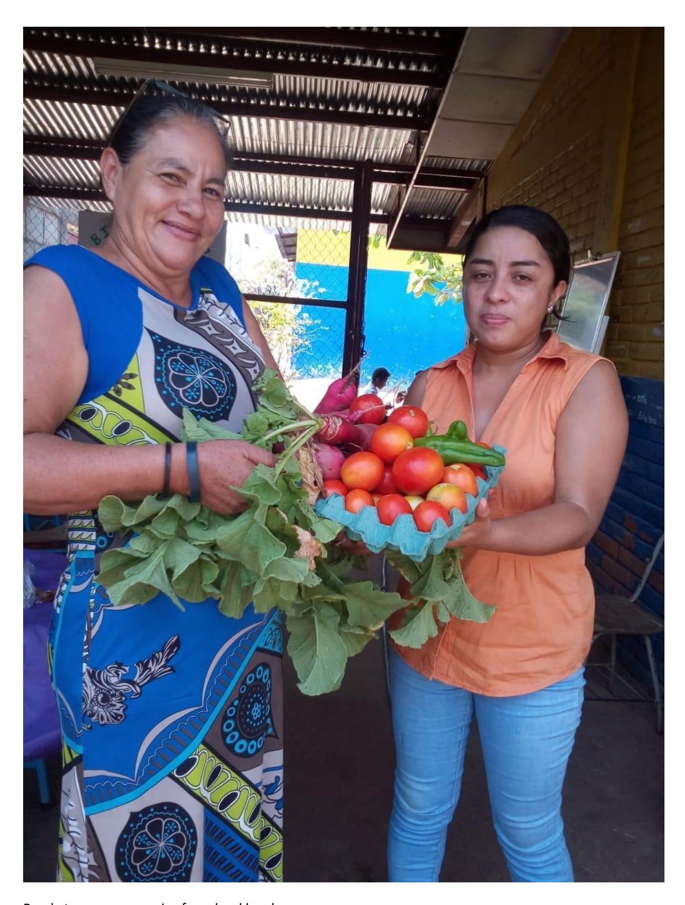
Ready to prepare veggies for school lunches.