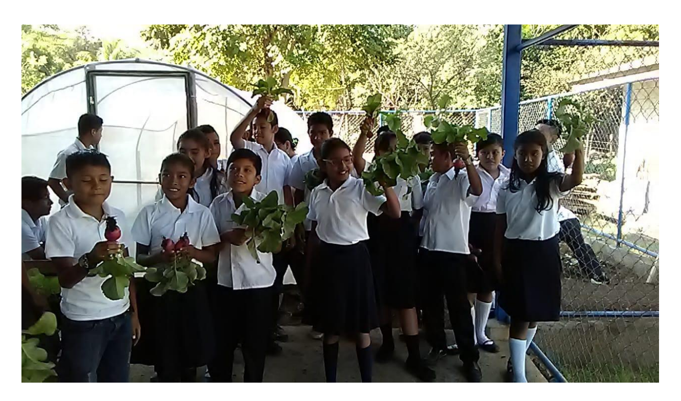
Students showing the vegetables collected from one of the gardens.