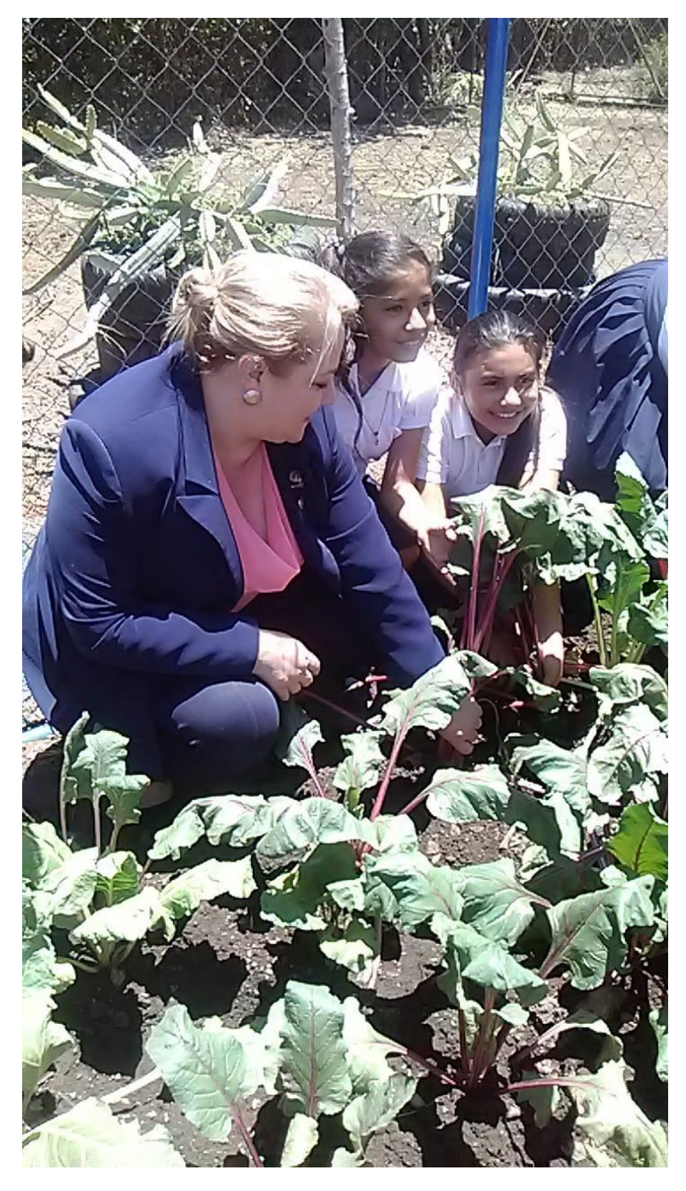
\hbox{District Governor for District 4240 harvesting with the students in one of the gardens. } \\