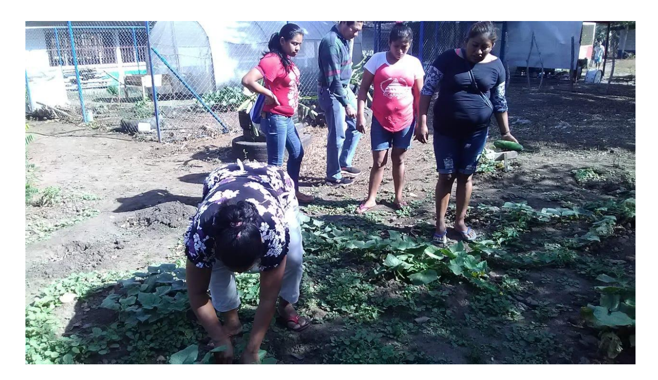
Students parents planting veggies.