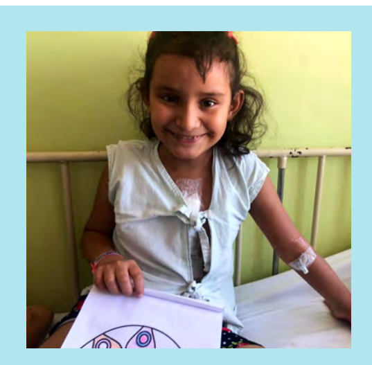
Every 3 hours a child with heart disease is eared for through our Global Network...