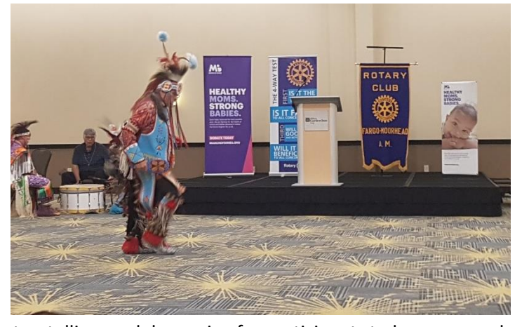
The Buffalo River Singers & Dancers provided dance, storytelling, and drumming for participants to learn more about indigenous culture.