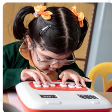
Student typing on Annie