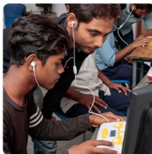
Teacher assisting learner