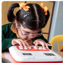
Student typing on Annie