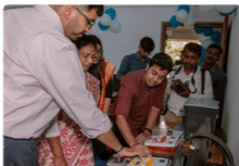
Annie being demoed to Minister of Social Welfare and the District Collector of Ranchi

In the district of Ranchi, lives of visually impaired children are being improved with the braille smart class!