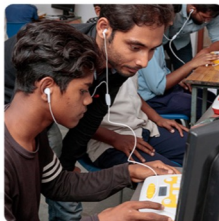
Teacher assisting learner