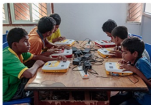
Braille Smart Class in Action at Rajyakrit Netrahin Madhya Vidyalaya

They learnt braille typing in just 90 days!