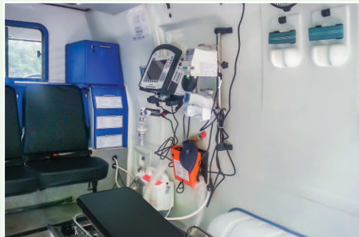
Side wall reinforced to mount Defibrillator, Ventilator, Suction Pump etc.