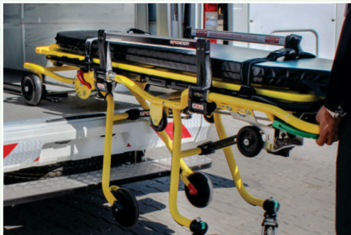
Auto Loading Stretcher - with foldable legs