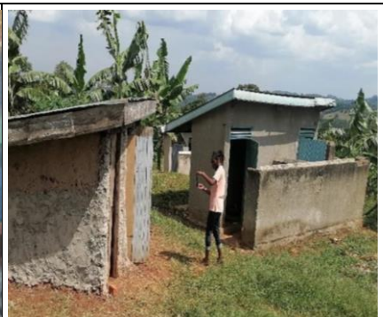
Toilet facilities 2022