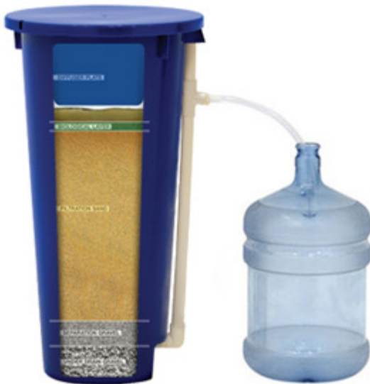
Cross Section of Plastic Biosand Filter