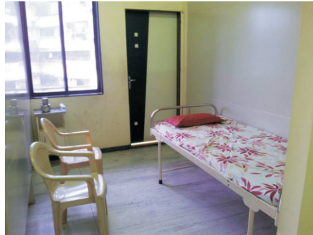
Delux Room for higher category patients