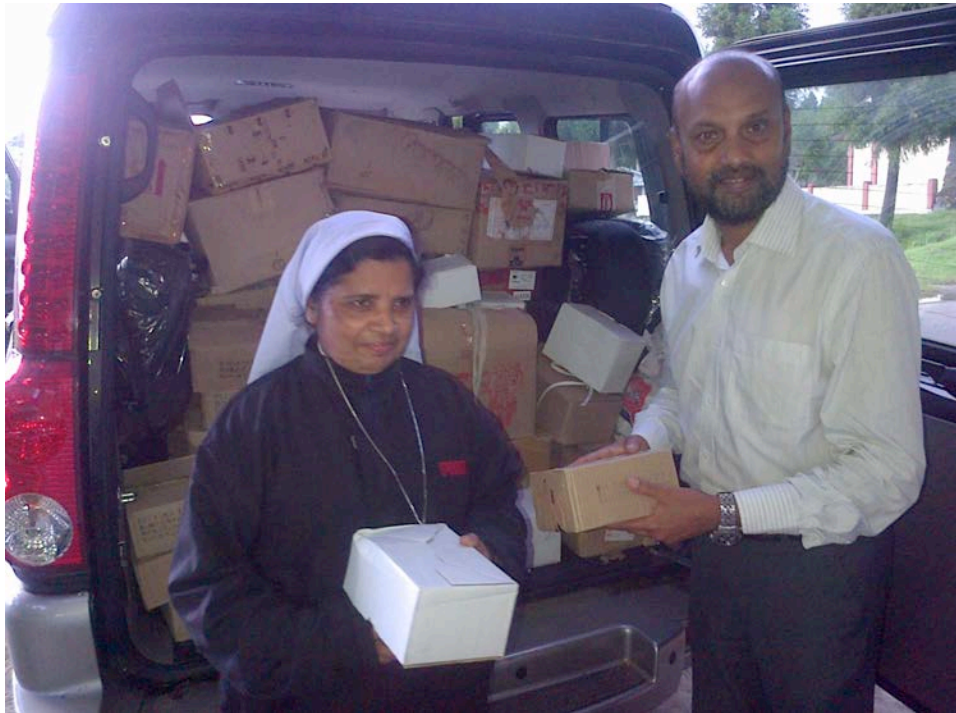
REGULAR DISTRIBUTION OF MEDICINES