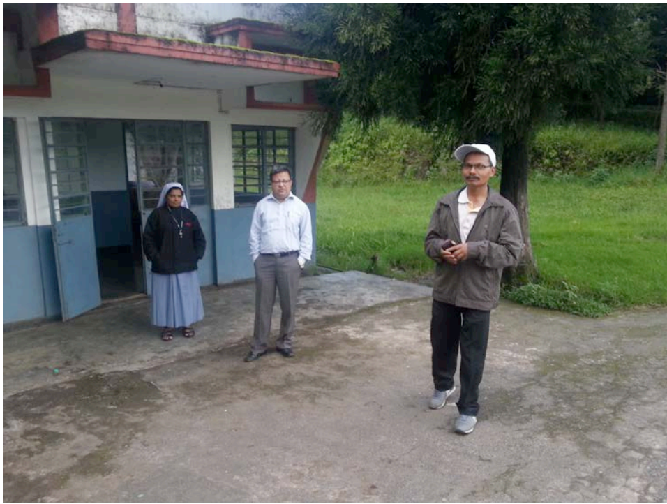
OUTSIDE THE JONGKSHA PRIMARY HEALTH CENTRE