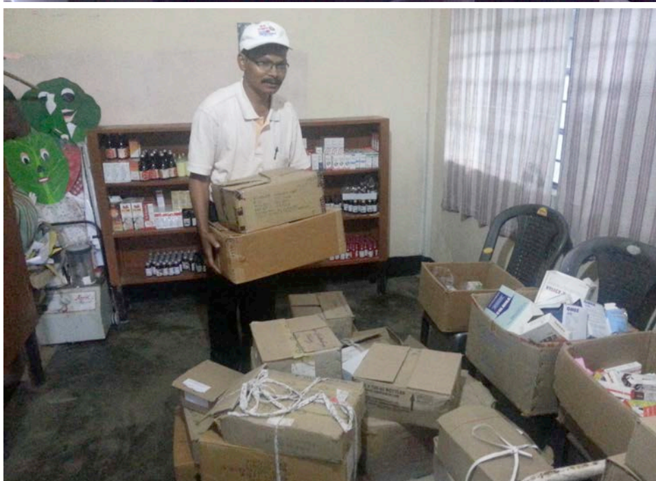
REGULAR DISTRIBUTION OF MEDICINES