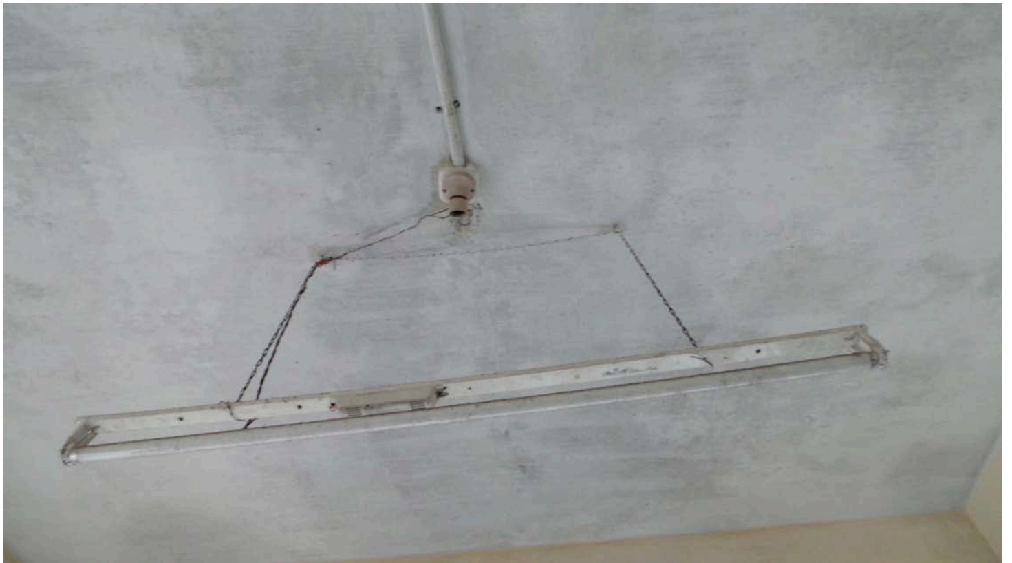
PORTION OF THE EXISTING ROOM FOR PATIENTS