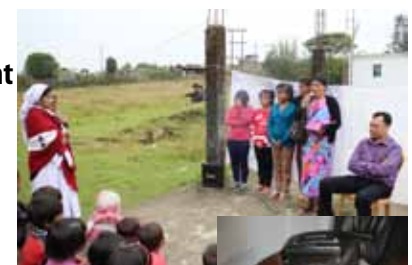
Remote village health camp and education will be supported by vehicle outfitted with generator, sound system, projector for videos and more.