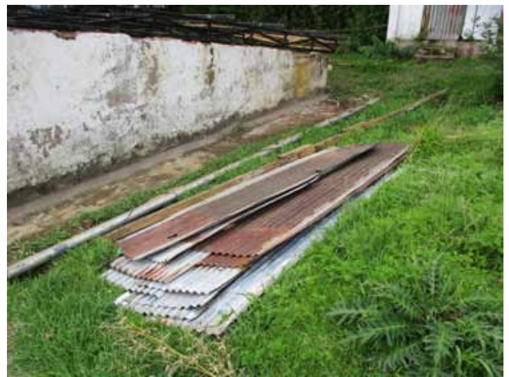
Clean water project. The clinic's drinking water well, below spring source, and corroded covers before repair work. Well was refurbished, recoated. A truss structure was installed to support a new roof. Now crystal clear and safe water is available. Additional plumbing improvements were made in the clinic.