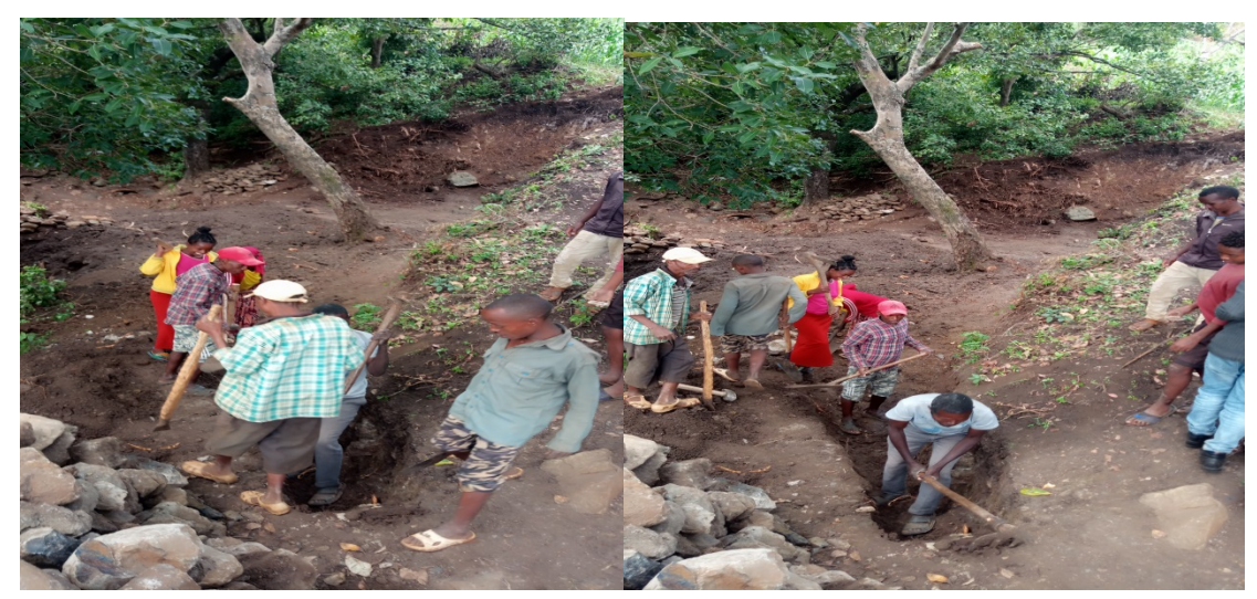
Trench Excavation at Doge Laroso

Local community members excavated the Doge Laroso kebele trench.