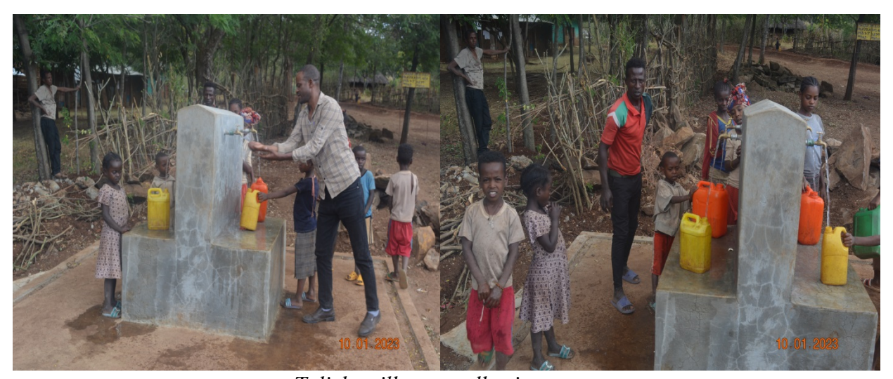
Tulicha villagers collecting water