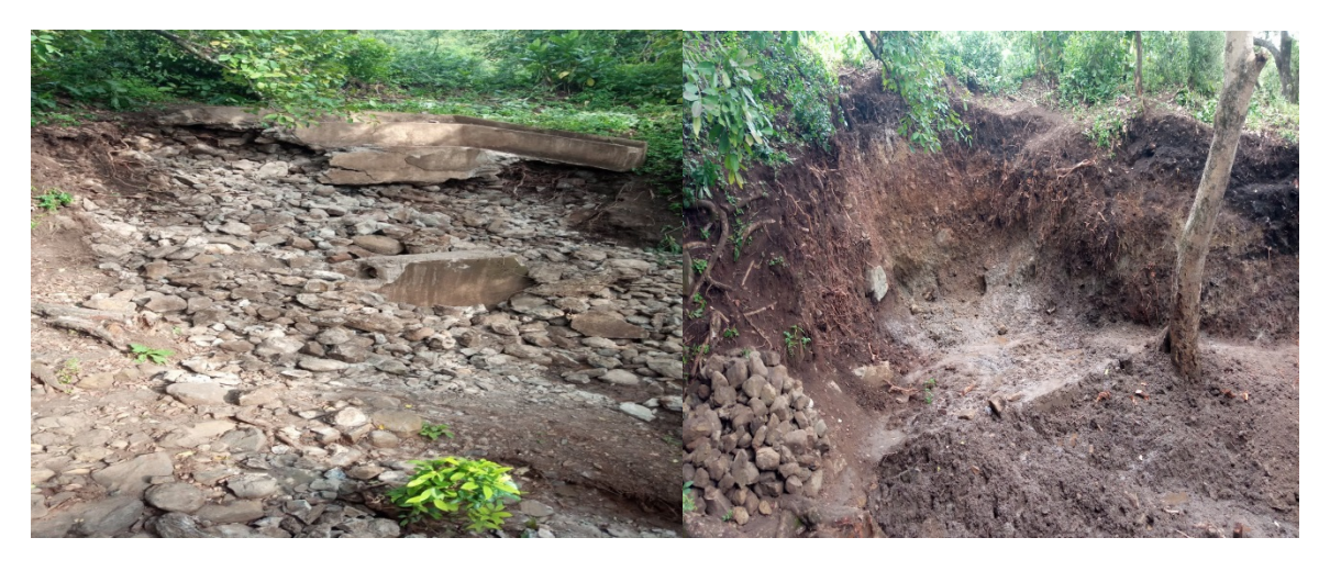
The existing structure at Doge Laroso

Demolishing the existing structure consumed most of the project work time