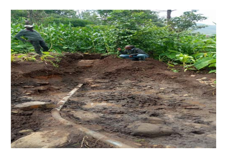
The beginning of bulk excavation work at the Doge Laroso site.