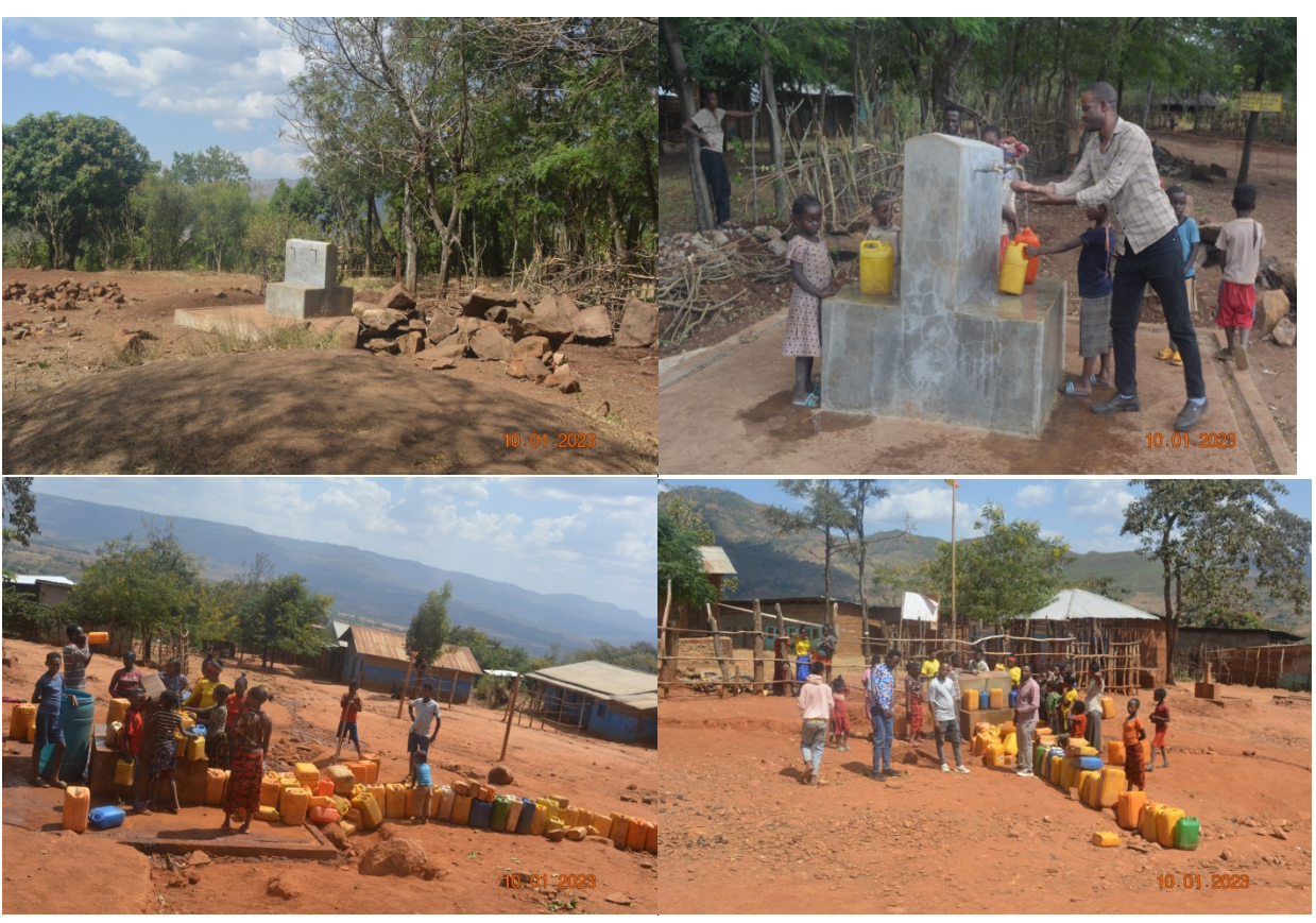
Doge Laroso villagers collecting water