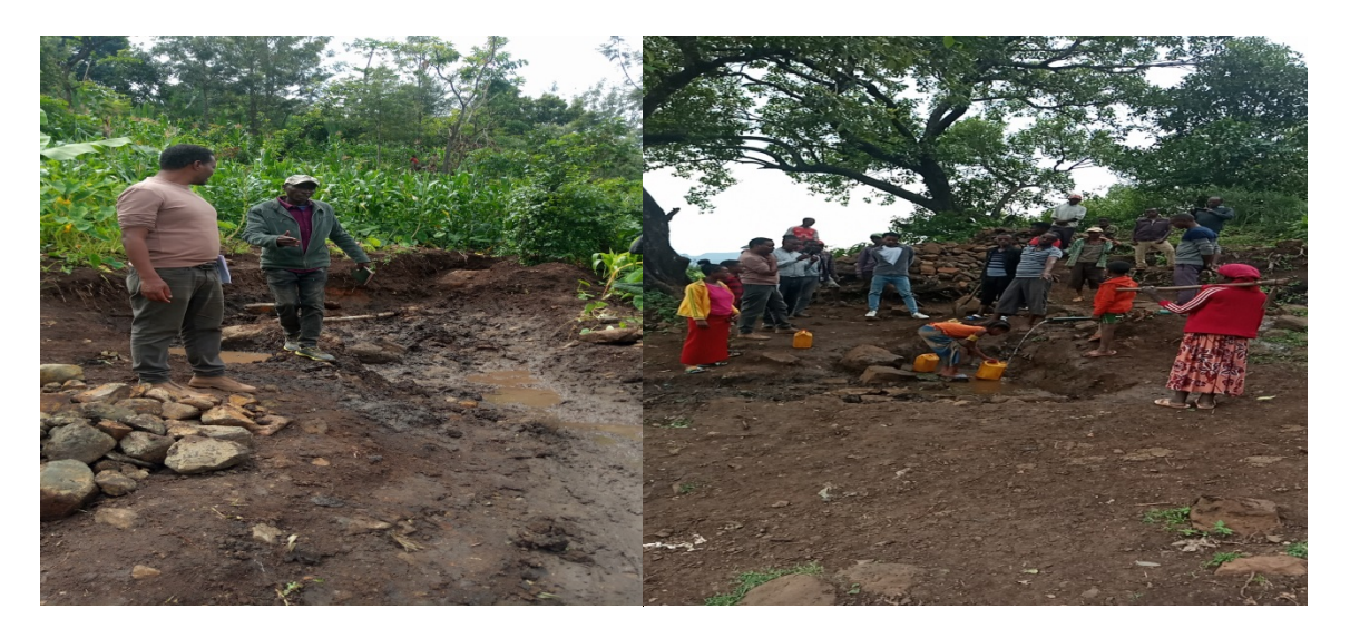
Site Clearance at Tulicha

The Wolaitta Development Association's engineers supervised the site clearance at the Tulicha and Doge Laroso No. 2 sites.