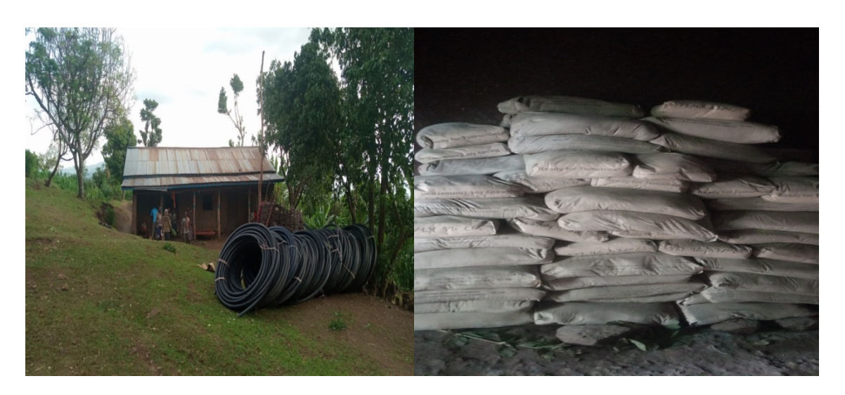
HDP/ Plastic Pipe