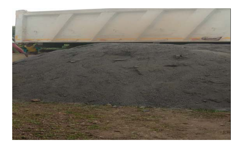
Sand transported to the site