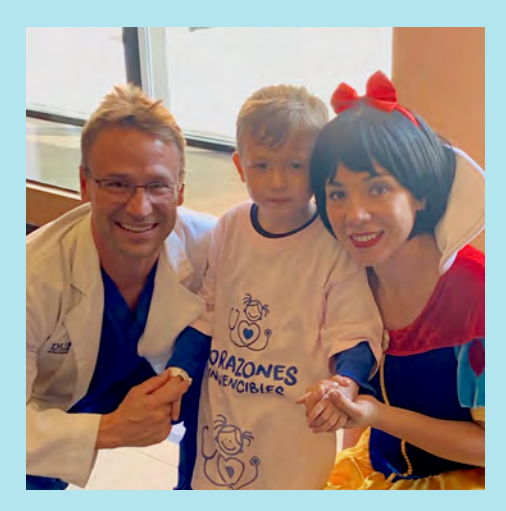
Every 3 howrs a child with heart disease is eared for through our Global Network...