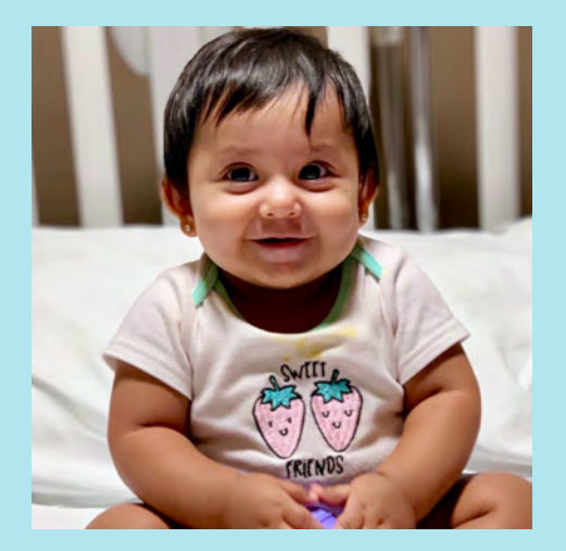
Healing Little Hearts Around the world...