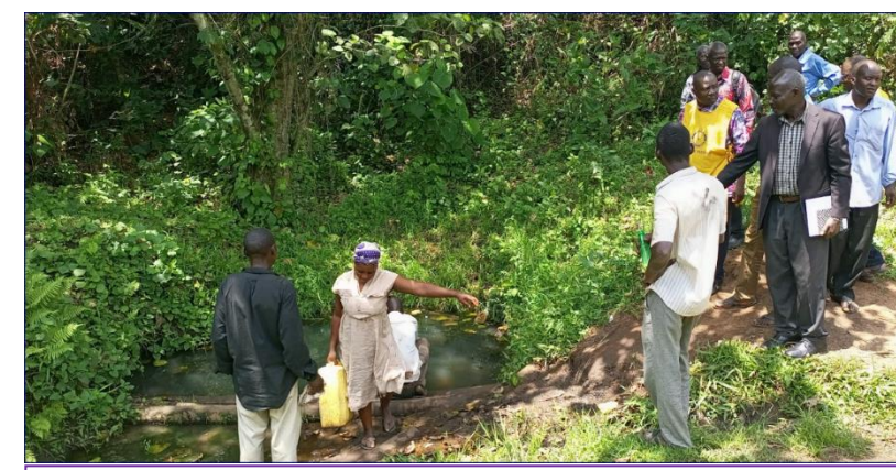
The open water well in Kyenyange village

These open water sources are unprotected streams flowing from the hills and don't dry during heavy dry spells. The residents highlighted challenges faced while fetching water from these open wells. They noted that