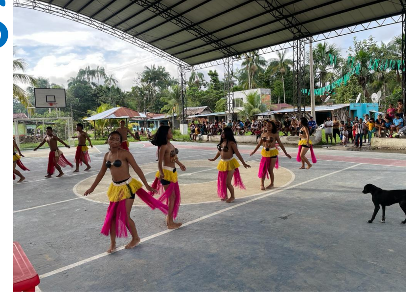
Residents of the indigenous community

This is relevant and impactful because promotes the competitiveness, productivity, welfare and health