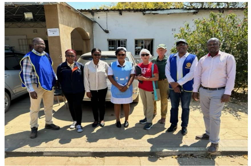
Shown above are Rotary Club of Nkwazi team members and the Needs Assessment Representative.