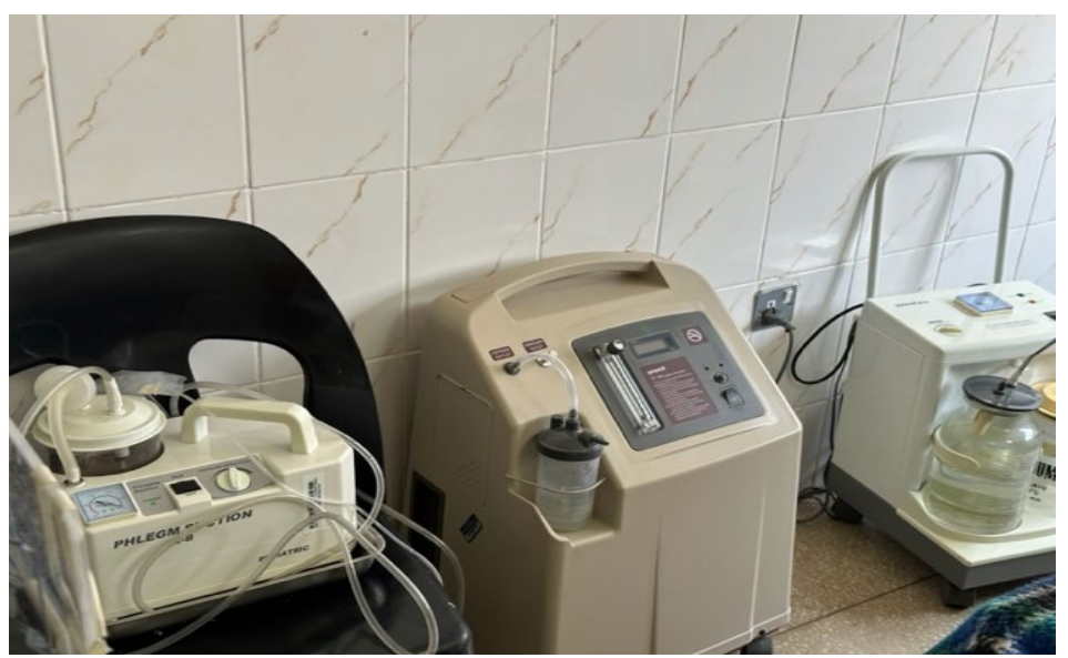
Pictured above is some of the equipment that was seen that is not currently working.

At the time of the assessment, the facilities did not have the capacity for Helping Babies Survive or Helping Mothers Survive Trainings.