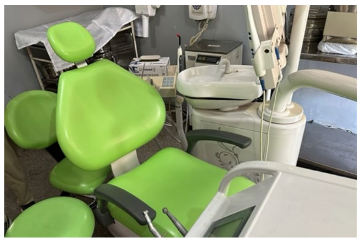
A recently donated dental unit with chair is pictured above.