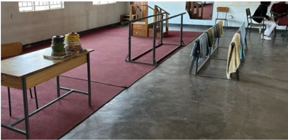
The new rehabilitation clinic is shown above. It is in need of additional equipment.