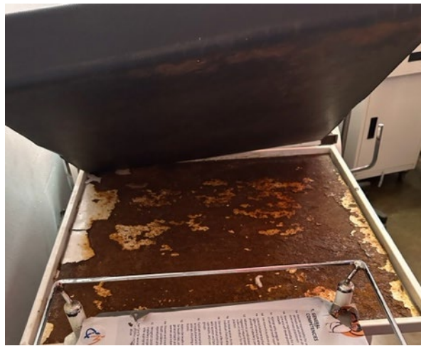
A rusty hospital bed is pictured above.