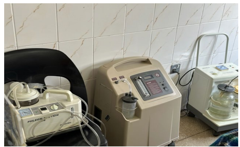
Pictured above are suction units and an oxygen concetrator that were nonfunctional.