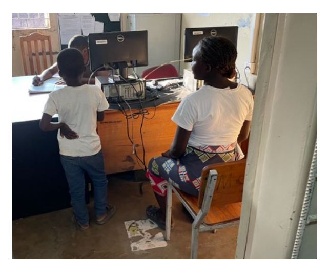
ART, Diabetes and Malaria Clinics are held weekly. They are requesting additional furniture to accommodate the large numbers of patients.