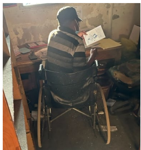
A long-time volunteer carefully fills out each individual health record.