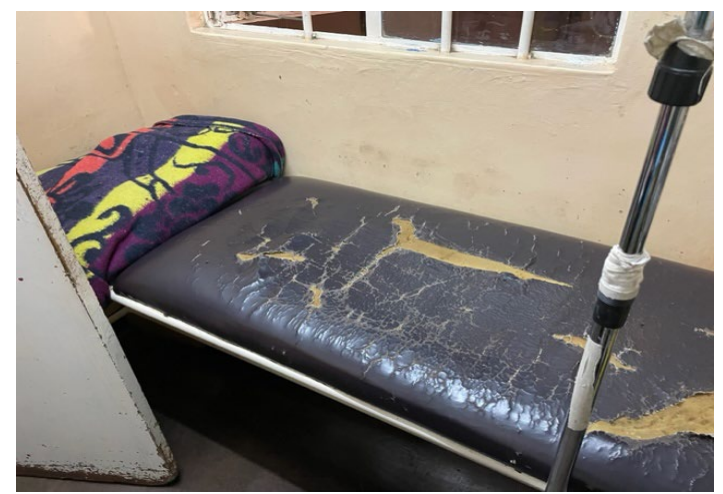
Many of their 10 beds are old and they have no inpatient facilities.

The government supplies 100% of the phamacy supplies on a consistent basis.