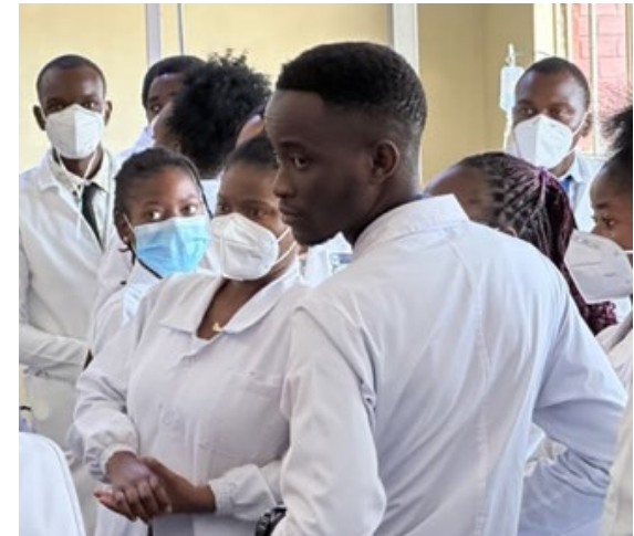
A robust training program fuels the facility's capacity to care for many patients.