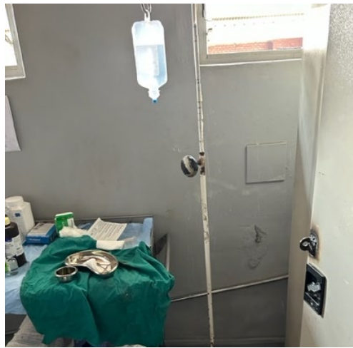
An IV pole with a patient cart is picture above. Throughout the facility there was a noted lack of consumable supplies.