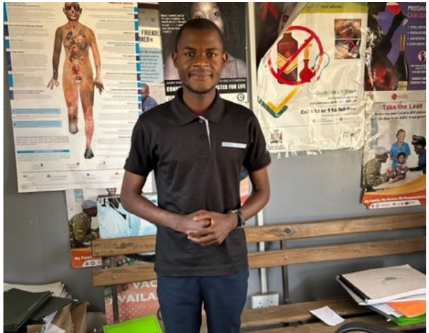
Pictured above is the waiting area. Male-friendly clinics are becoming more popular in Zambia.