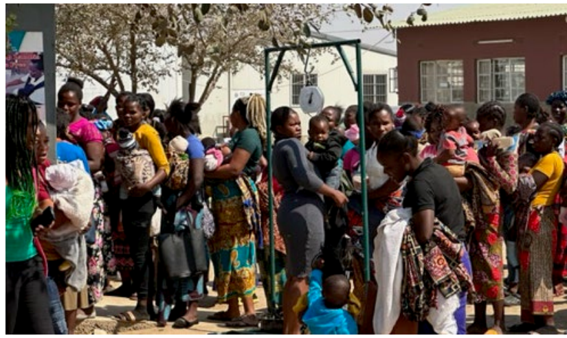
Pictured above are patients waiting in line to be seen. This facility was very busy.