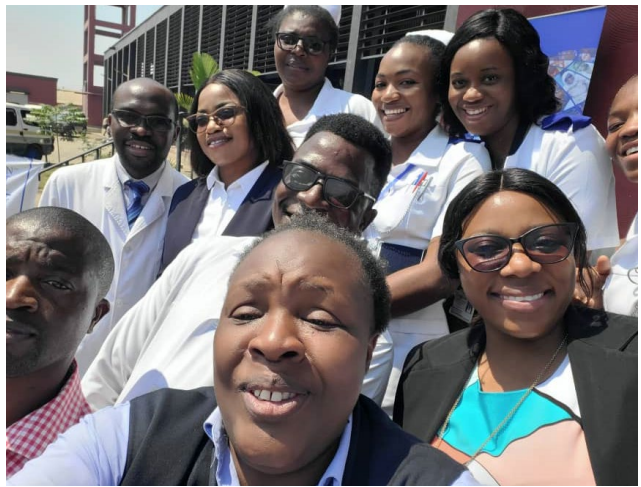
Pictured above are staff members.