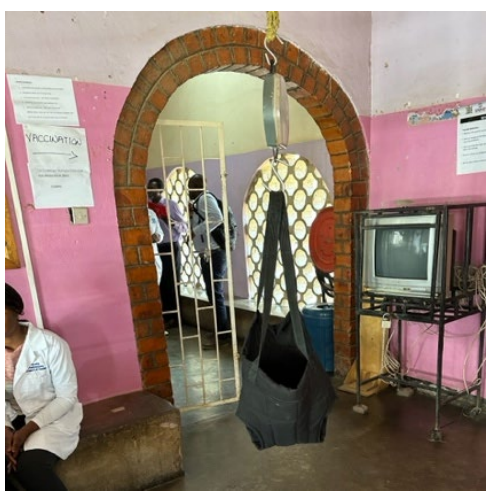
An infant scale is pictured above.