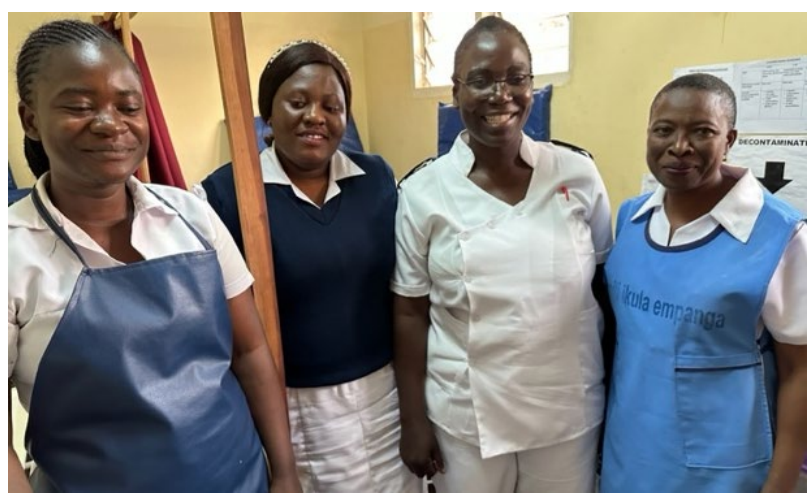
The ART Clinic is working with a local non-profit to recruit community health workers to work with patients in their villages. Pictured above are staff members.