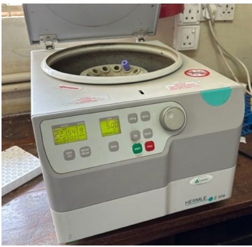
The above pictured centrifuge is non-functioning.