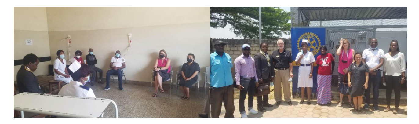
L. Community Needs Assessment with Community Leaders, GSE Team and Health Staff R. Photo moments in front of the Generator and Generator shelter that was built using District funds